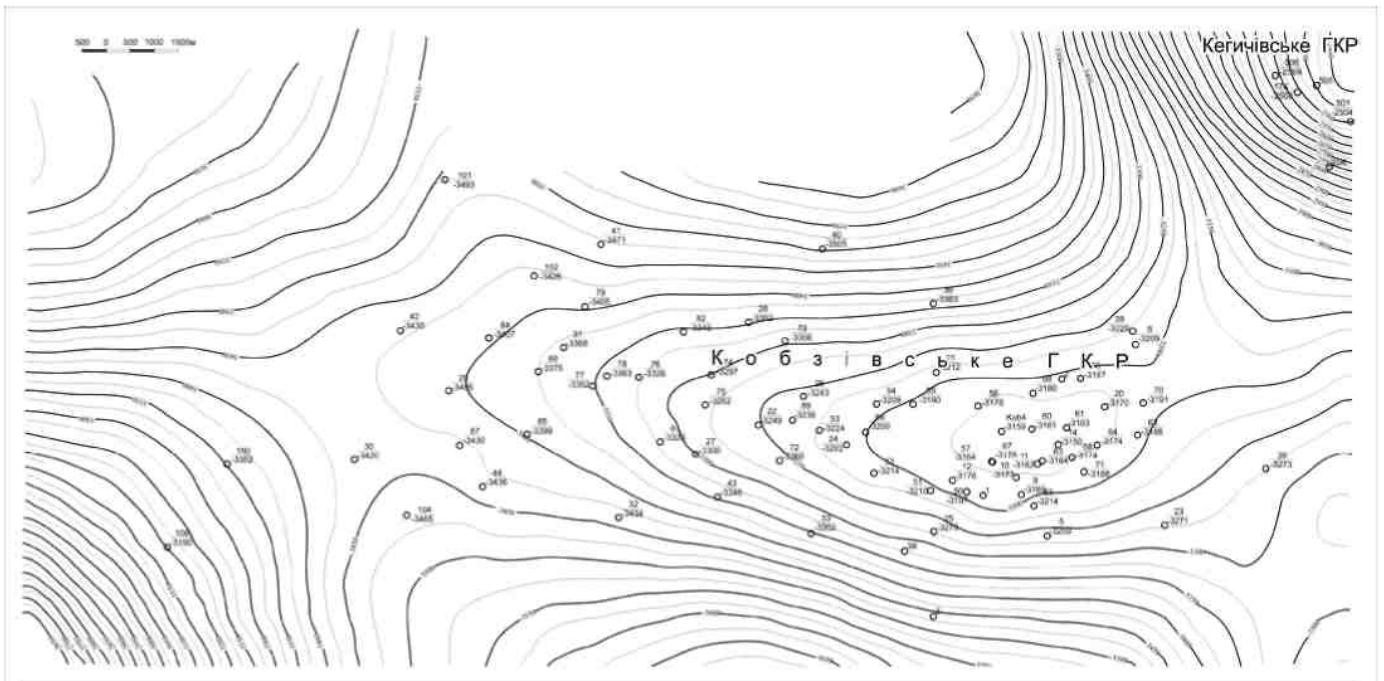
Fig. 1. Kobzivka GCM. Seismic structural map by the reflecting horizon of IV G2

The southern wing of Kobzivka structure is immersed into Grygorivka synclinal basin, the northern wing – into the South-Sosnivka basic; it opens towards Kegychivka anticline through a narrow saddle (the amplitude of the arch from the saddle level is around 80 m) in the east, and it borders with the northern wing of Oktiabrsk structure in the west (Fig. 1).