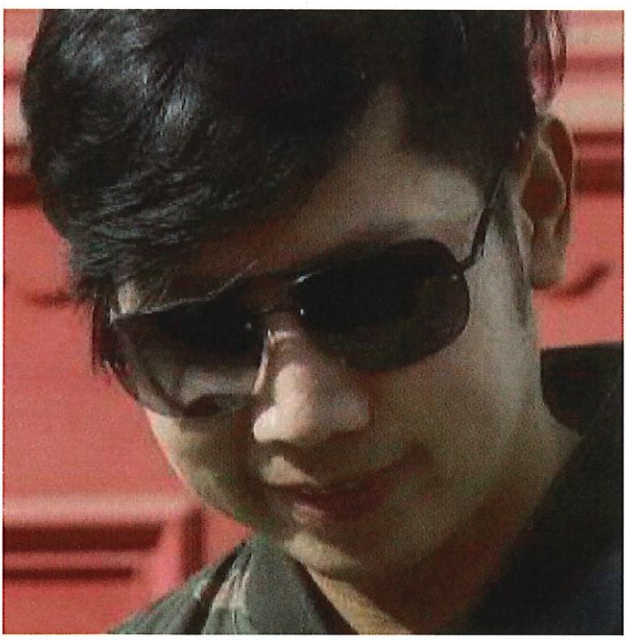
Red Bull Heir Accused of Killing Cop No-Shows at Court