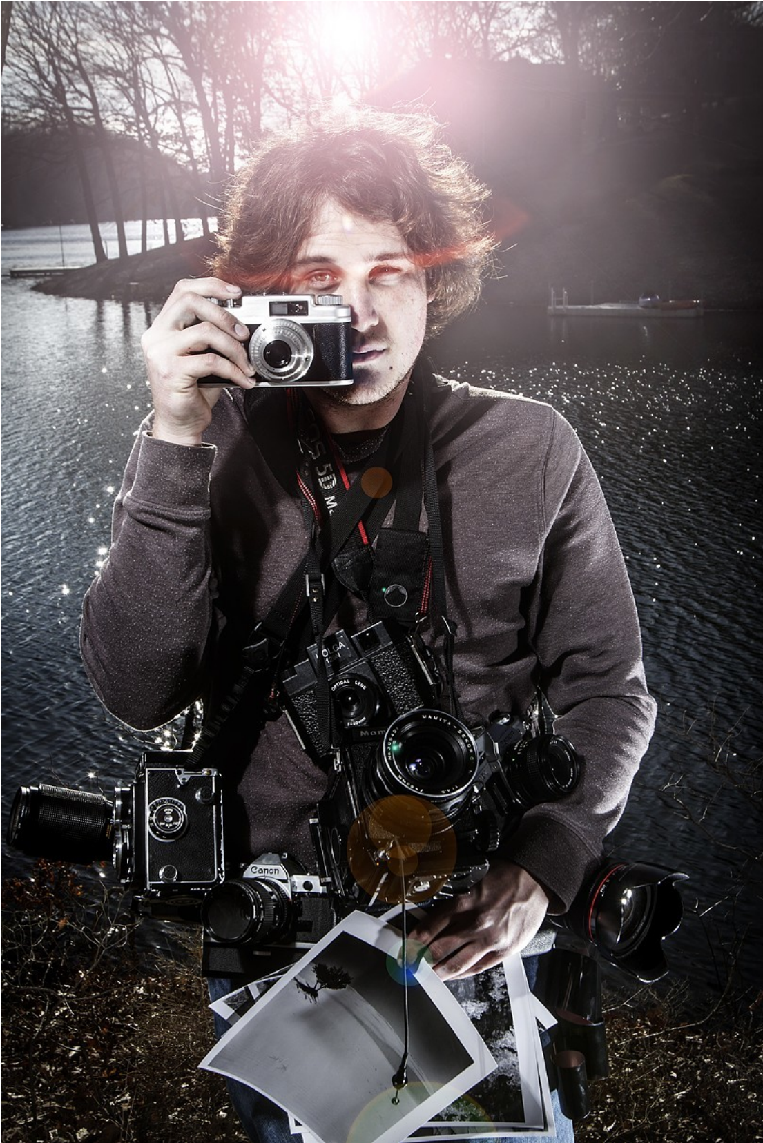
Figure 9. Portrayal: Kris Johnson: Photographer