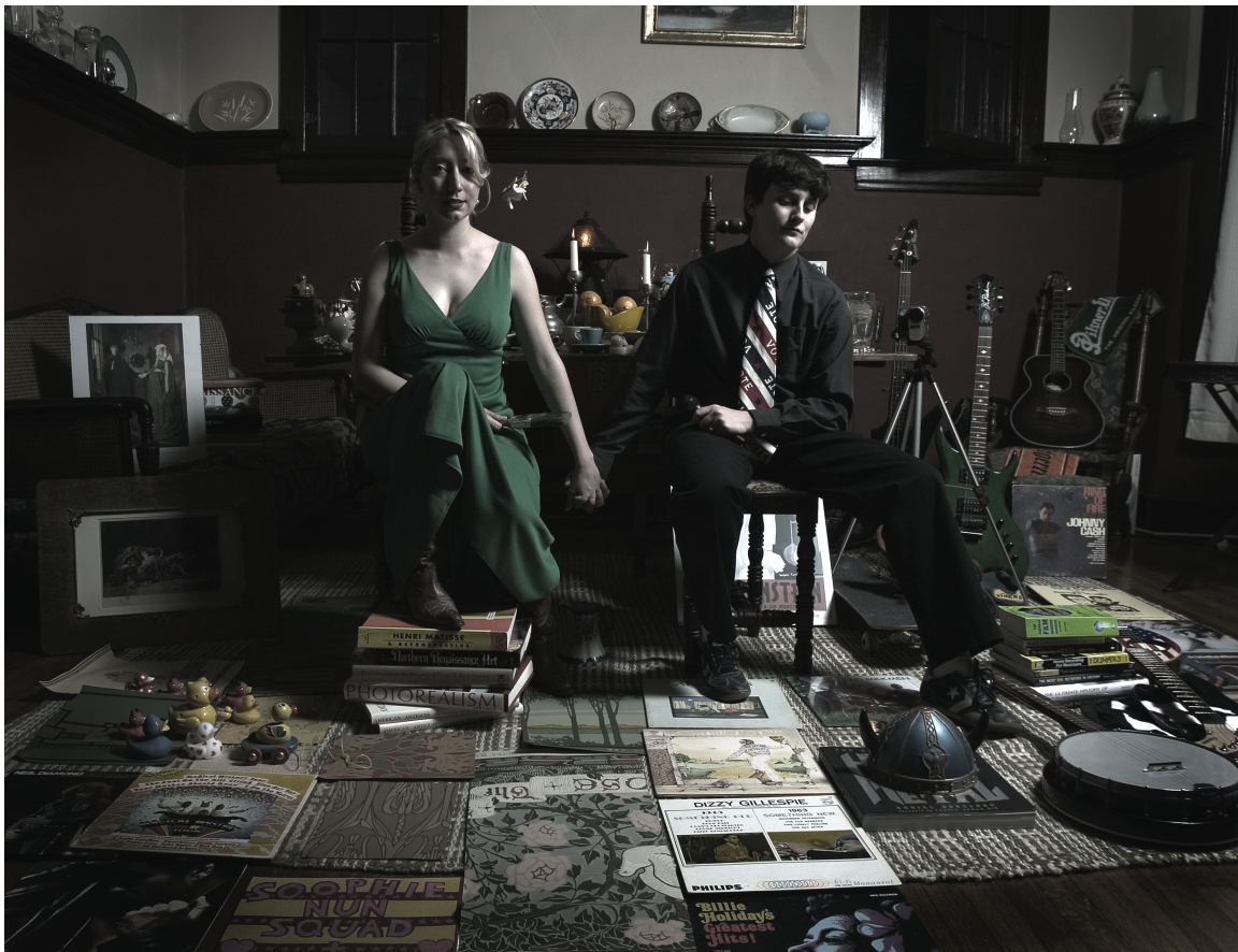
Figure 2. Habitat: 2315 South Summit