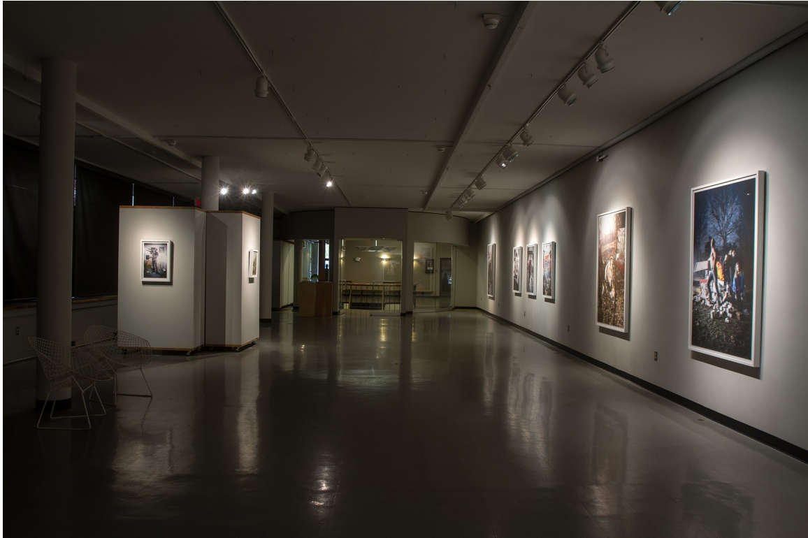
Figure 2. Installation image of the exhibition Portrayal