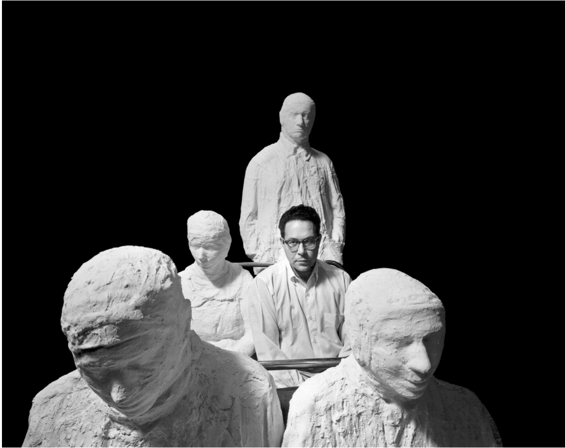
Figure 11. George Segal, with one of his works, photograph by Arnold Newman, 1964. © Arnold Newman