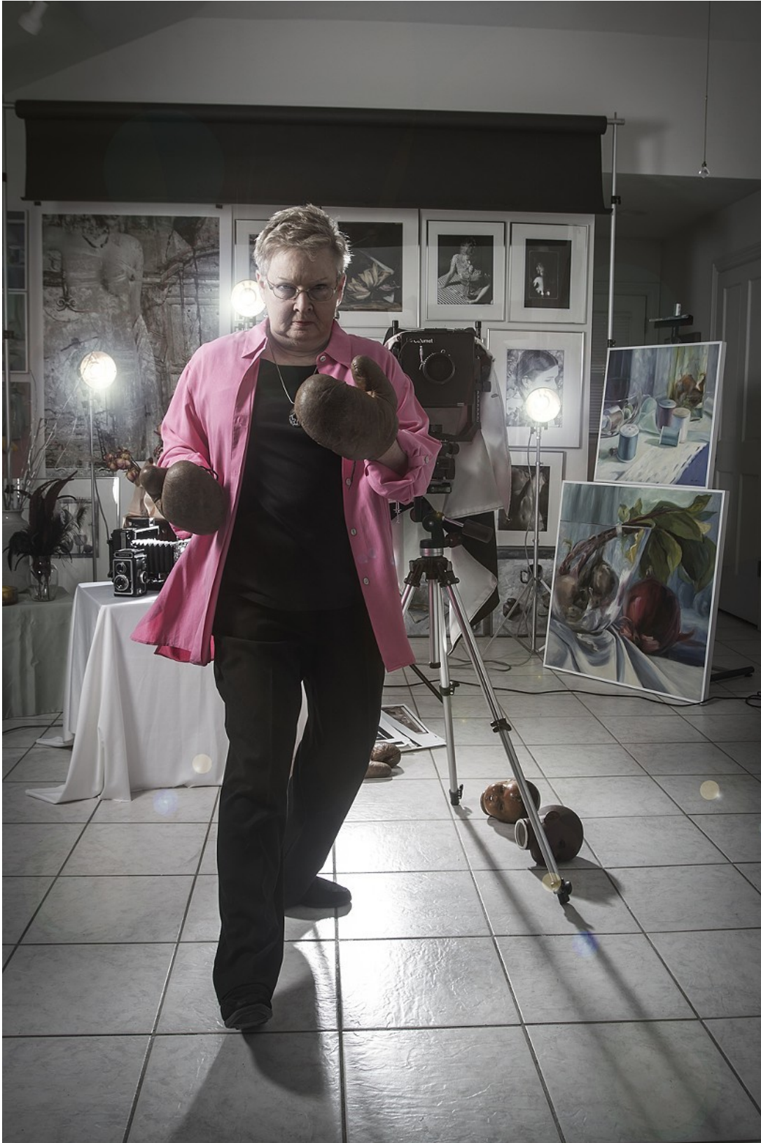
Figure 7. Portrayal: Joanne, Photographer/Painter