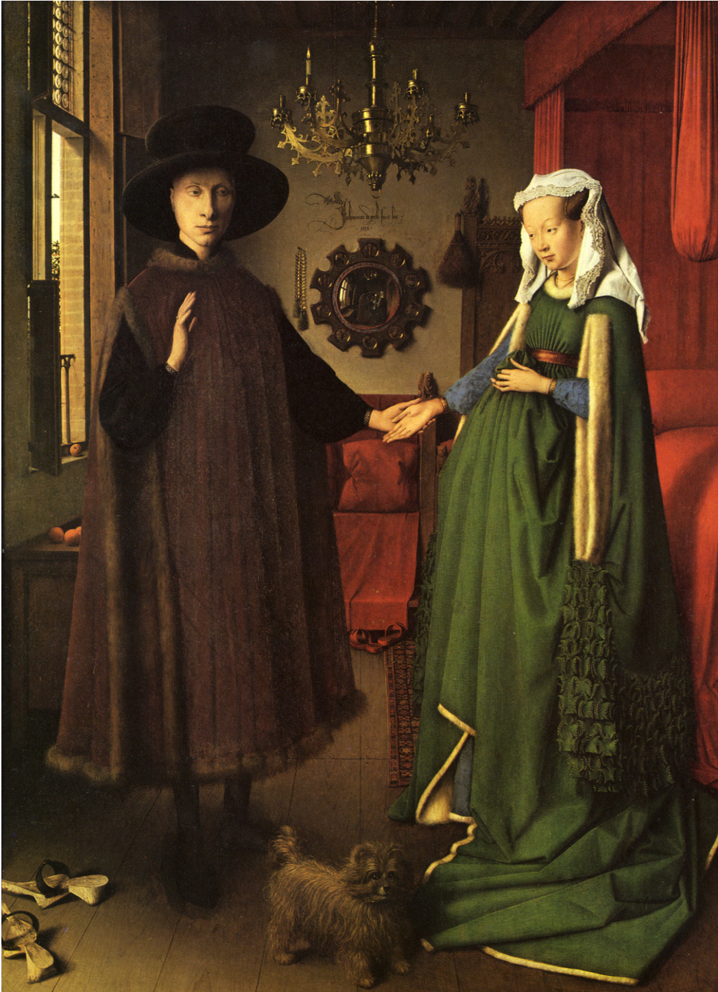
Figure 1. Arnolfini Portrait by Jan van Eyck.