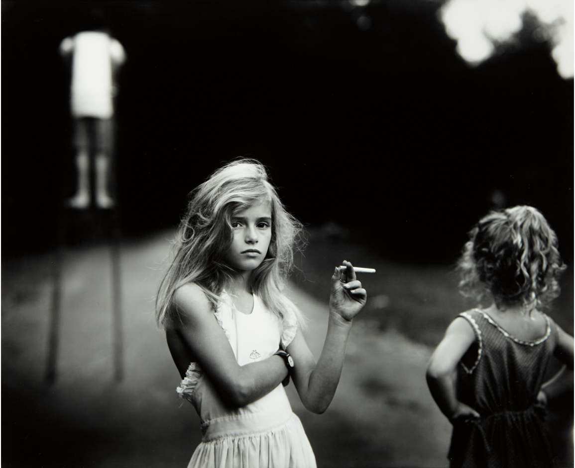
Figure 8. Candy Cigarette , 1989, photography by Sally Mann© Sally Mann