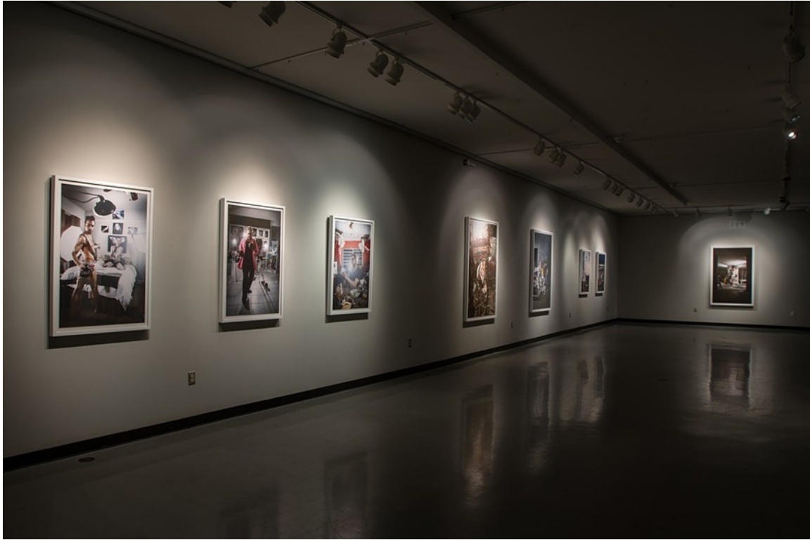
Figure 3. Installation image of the reception for the exhibition Portrayal