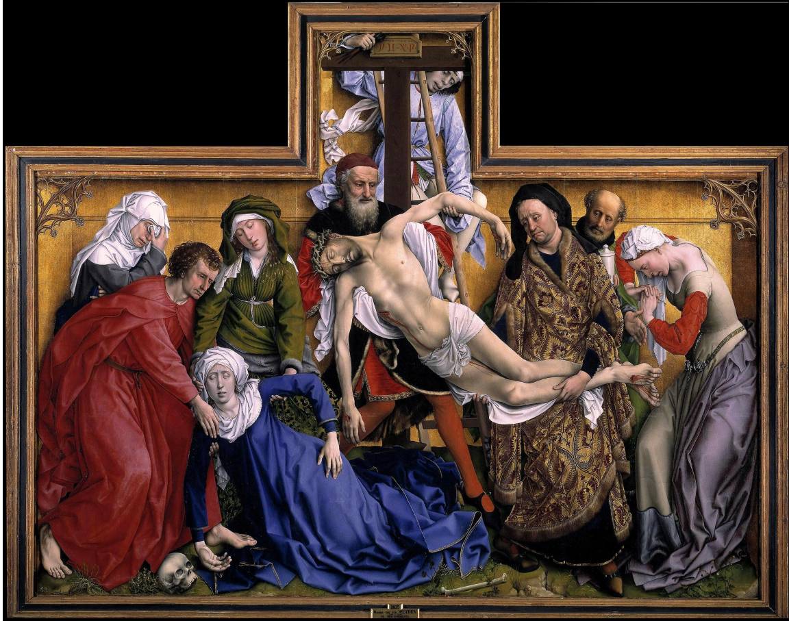
Figure 4. Deposition by Rogier van der Weyden