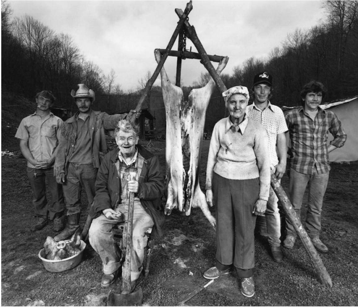
Figure 9. The Hog Killing, Spring 1990