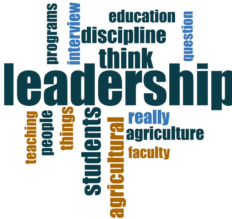
Figure 3. Word-cloud representing the 15 most frequently used words by faculty