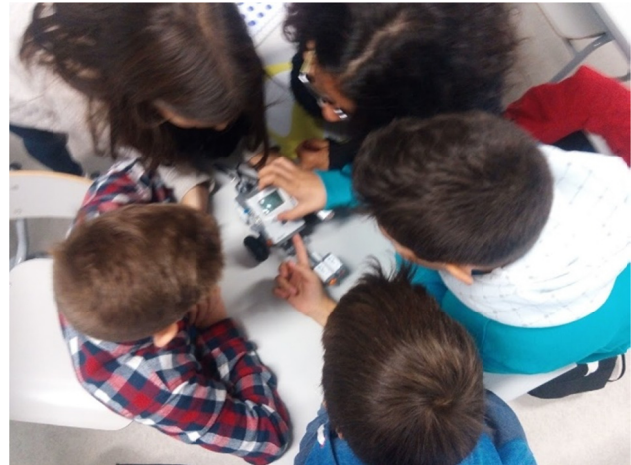
Figure 7. Students programming

providing the means for a mobilizing and facilitator thought of the dynamics of construction of their own knowledge. It is clearly an entry into an important cognitive phase for the group/ class. There is a degree of self-esteem that allows the group to start developing assumptions and seek to support them.