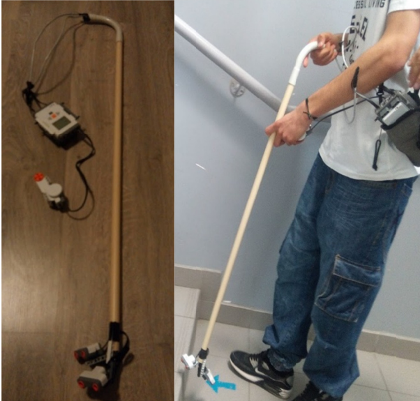
Figure 6. The smart walking stick

and test all decision and repetition structure blocks. The NXT Smart Brick module controls the servomotor by the RJ12 outputs. This communication is established when the system detects any object on its way. When the servomotor is operated it creates a counter-clockwise rotation that is felt in the user's hand (Figure 6).