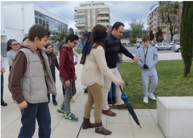
Figure 2. Test of "Orientation and Mobility"

The development phase of the project went through a test of "Orientation and Mobility" for the blind people carried out by students, by walking through a path to assess the physical barriers. After the accessibility diagnosis, a further study of the sensors and possible materials to be used in the development of the prototype was initiated (Figure 2).