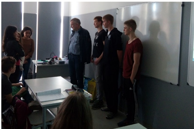
Figure 4. Students and a school teacher from “Sydvestjyllands Efterskole” school

was difficult, since all the dialogue was in English (Figure 4).