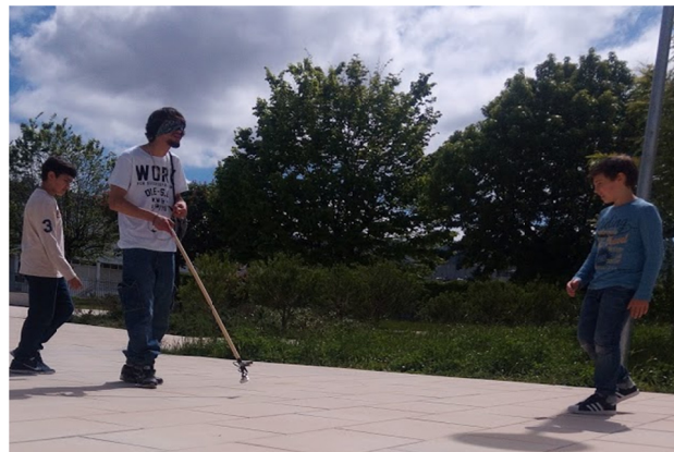
Figure 5. First version of smart walking stick

with an affordable prototype, easy to use, and functional model that helps the mobility of the visually impaired. The prototype recognizes the environment and points out possible obstacles and threats to mobility (Figure 5).