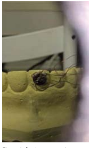
Figure 2: Strain gauge on the centre of the tooth.