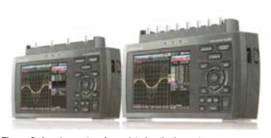
Figure 3: Accelerometers for registering the impact.