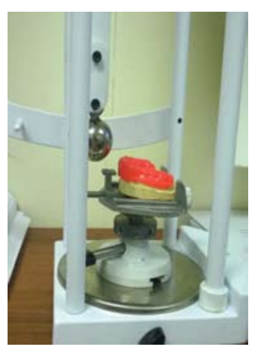
Figure 1: Pendulum type impact testing machine.

The differences between the data recorded for the two mouth guards was tested by a Univariate analysis of variance with MAX and Proform as fixed, and batches as random factors. The Type IV mouth guard (Max) had a significantly higher level of shock absorption (Table 1) than Type III (Proform): F_{(1.6)}=96 ; p< 0.001 ^2p=0.94 .