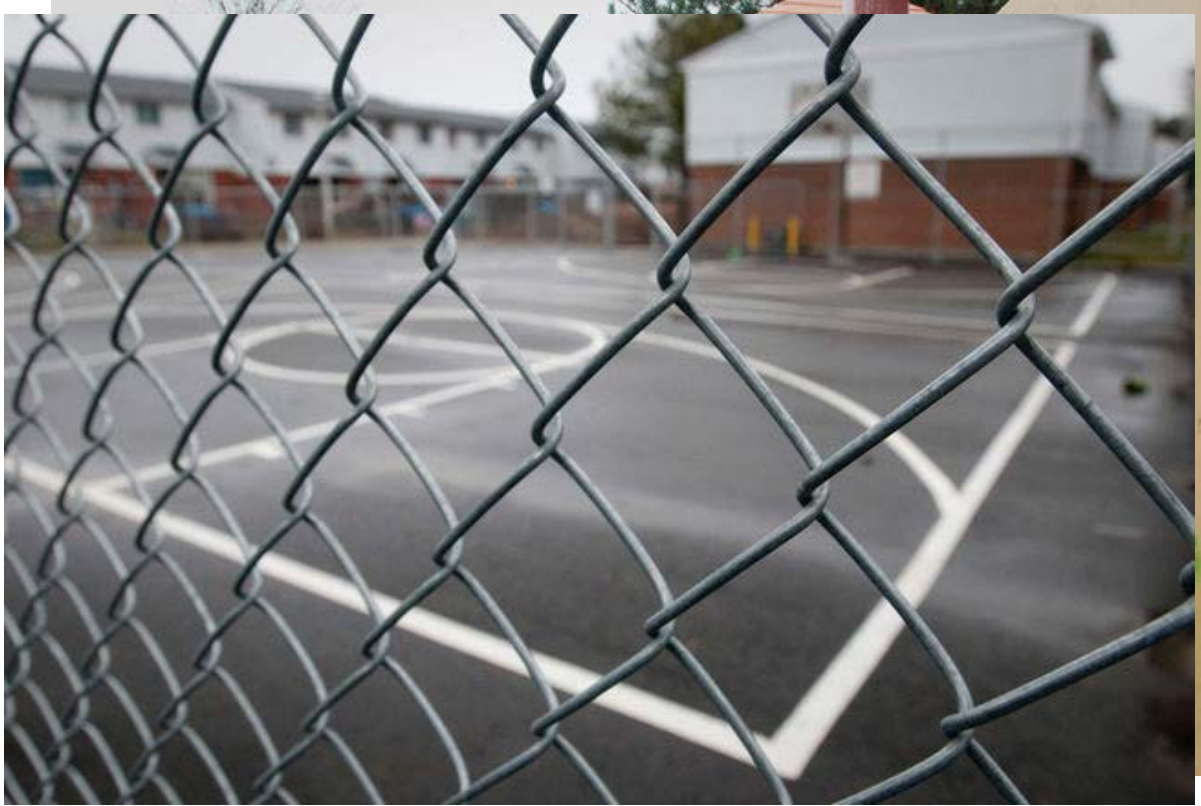
Appendix 7 - Picture of a fenced in basketball court in South dale.