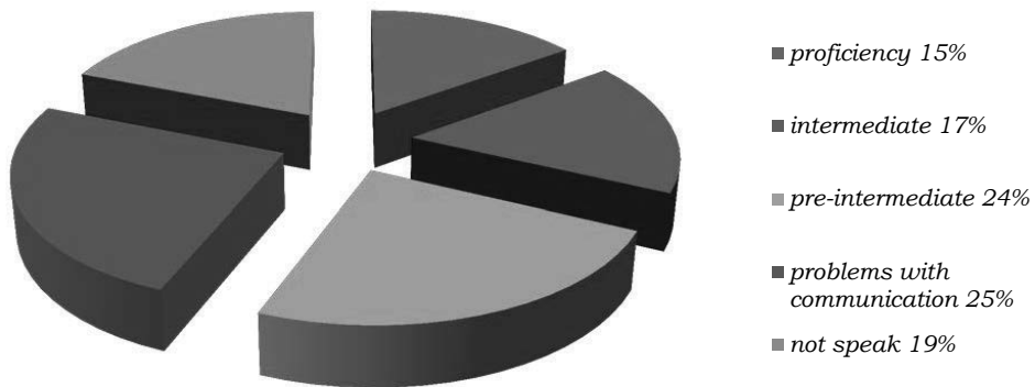
Chart 2. Declared knowledge of Estonian language among Russians in Estonia (2008)