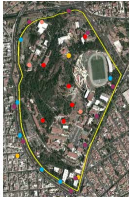
On June 8, 2015.