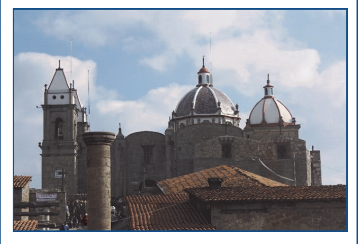
Figure 3: The Sanctuary of the Lord of the Hill