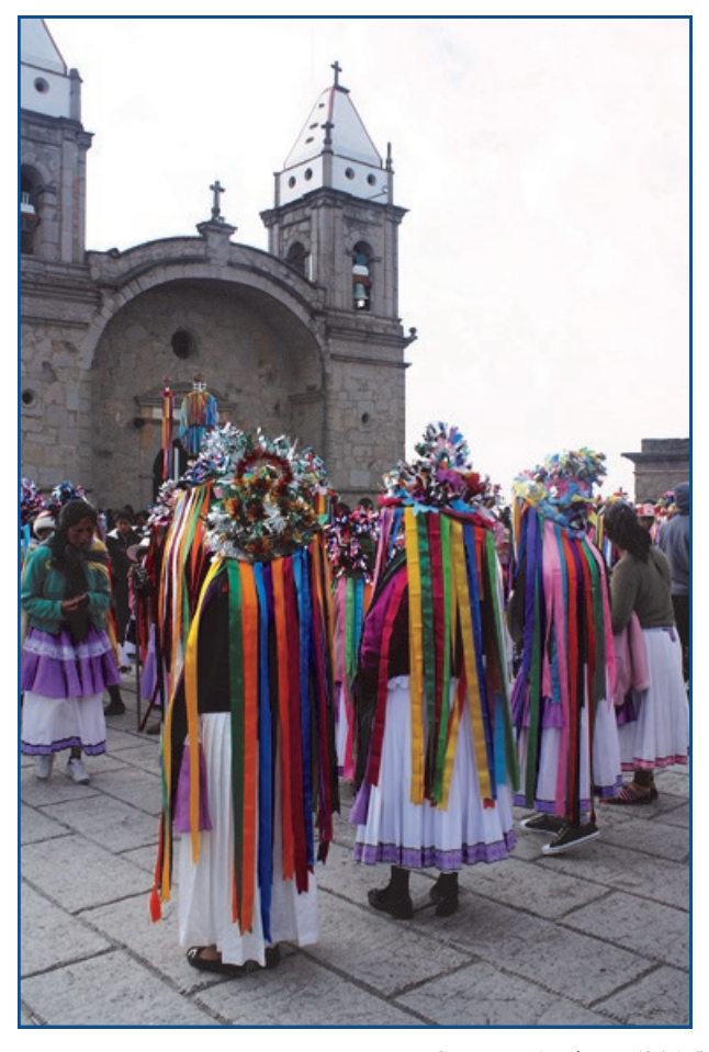
Figure 4: Traditional Pilgrimage Dancers