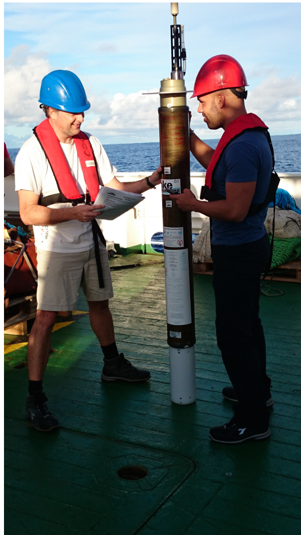
Figure 2. Argo's configuration step through Bluetooth connection before the deployment phase.

A configuration parameters step is needed before the deployment phase (Fig. 2). For our purposes, the float was initially programmed to dive every 5 days measuring temperature and salinity during the ascending phase. After that, the float is planned to dive every 10 days reaching also 4000 meters of depth. One of the aims of this change is to save energy and to extend the lithium battery life as much as possible (3.5 - 4 years luckily).