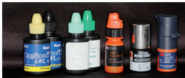
Fig. 1. Adhesive systems used in the experiment.

The specimens were randomly divided into 6 groups (n=10), according to the different type of conditioning they received: G1 - no surface conditioning (control), G2 – three-step total-etch adhesive (OptiBond™ FL, Kerr, Orange, CA, USA), G3 - three-step total-etch adhesive (Adper™ Scotchbond™ Multi-Purpose, 3M ESPE, St Paul, MN, USA), G4 - two-step total-etch adhesive (Adper™ Single Bond 2, 3M ESPE, St Paul, MN, USA), G5 – one-step self-etch adhesive system (Bond Force, Tokuyama, Osaka, Japan), G6 - Universal system (Single Bond Universal, 3M ESPE, St Paul, MN, USA) (Fig. 1).