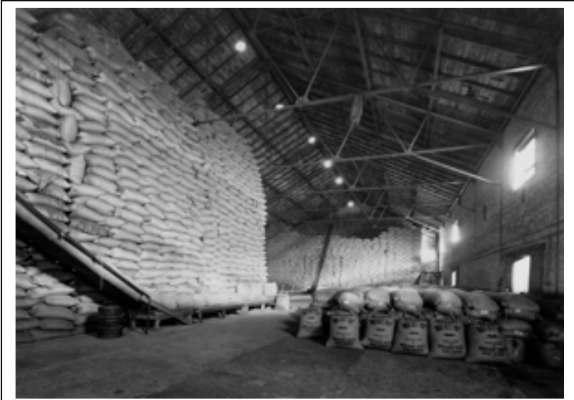
The pulp warehouse of the American Beet Sugar Company in Mason City, ca. 1910–1920.

industries, although some also labored seasonally for the American Beet Sugar Company.