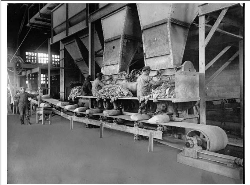
A diverse immigrant workforce worked at sacking machines at the Portland Cement Company in Mason City.