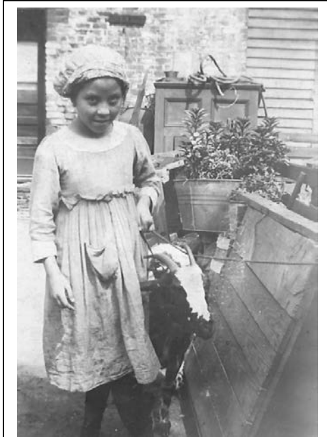
Mexican immigrant families tended gardens and raised small animals to supplement their food. This photo, taken in Bettendorf, ca. 1923, is from the Estefanía Joyce Rodriguez Papers, Iowa Women's Archives.

Mexican women also tended gardens on land provided by the railroad, cement, and sugar companies. They raised chickens and pigs and grew vegetables as well as herbs and spices used in Mexican dishes. Such activities replicated their customs in Mexico's rural communities. This homegrown food not only sustained the family but also provided a revenue source when surplus eggs, vegetables, and meat were sold. 42 Beyond providing food, gardens were a source of pride for many boxcar residents who enjoyed