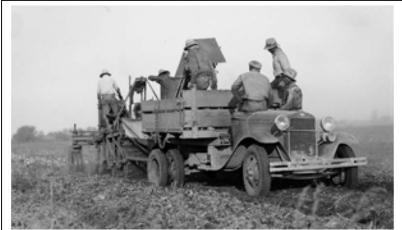
A group of farm workers and farmers ride on a truck near Mason City, ca. 1910–1920.

whites” who were not welcomed as permanent community members. Agricultural employers also sought Mexicans because of their lack of political strength in the Midwest, which made them more susceptible to labor controls and exploitation.