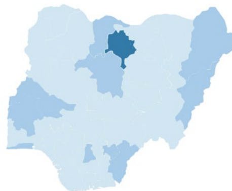
Figure 2. The expansion of magnesium sulfate for treatment of pre-eclampsia and eclampsia in Nigeria

As the expansion progressed, it became clear that efforts to initiate treatment at the primary care level were also needed; by the time women reached the hospital, the condition had often progressed past the point of effective treatment. A continuing grant to the Population Council in 2011 enabled focused attention at the primary healthcare and community levels to assess how best to involve traditional birth attendants, community health extension workers, and nurses in identification, immediate clinical care, and referral. The Population Council conducted operations research in 20 primary care facilities—10 with a task-shifting intervention and 10 without