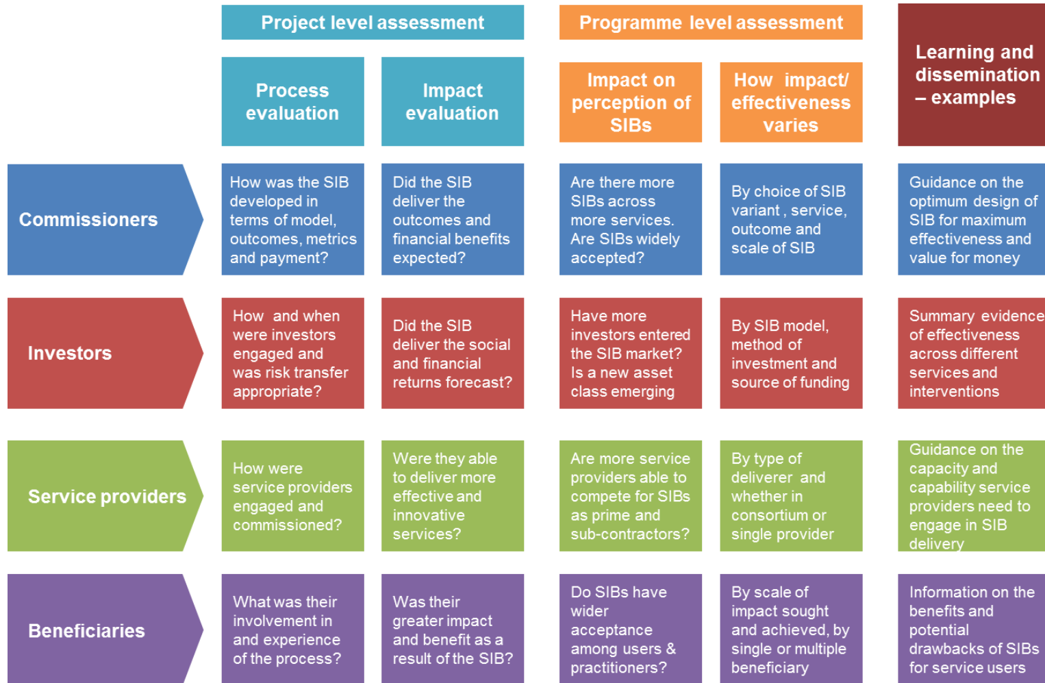
Figure 1.1 Key Focus of the Evaluation