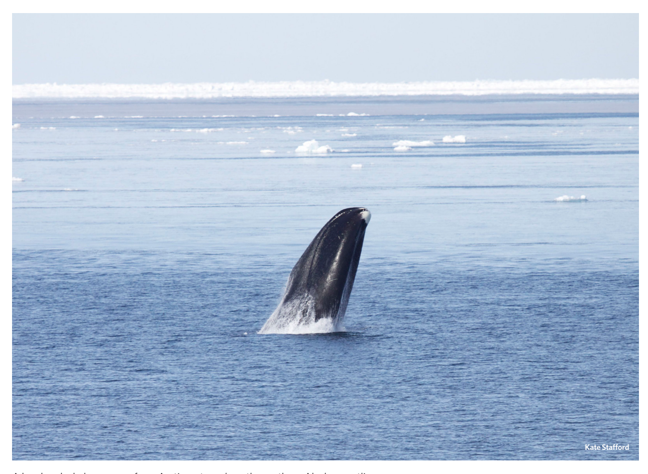
\label{eq:Abowhead} \mbox{A bowhead whale emerges from Arctic waters along the northern Alaska coastline.}

The balance between development and conservation in the U.S. Arctic Ocean demands ongoing evaluation, in consultation with indigenous communities and scientists, to identify important areas where certain kinds of industrial activity should be prohibited in order to ensure a healthy, sustainable, and resilient ecosystem for the long term.