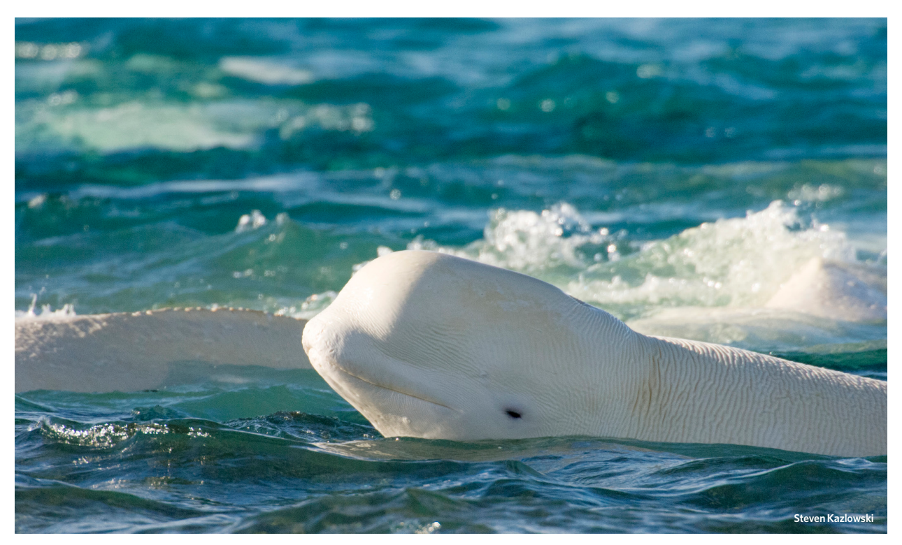
Beluga whales use the shelf break along the Beaufort Sea as a feeding area and major migration corridor.