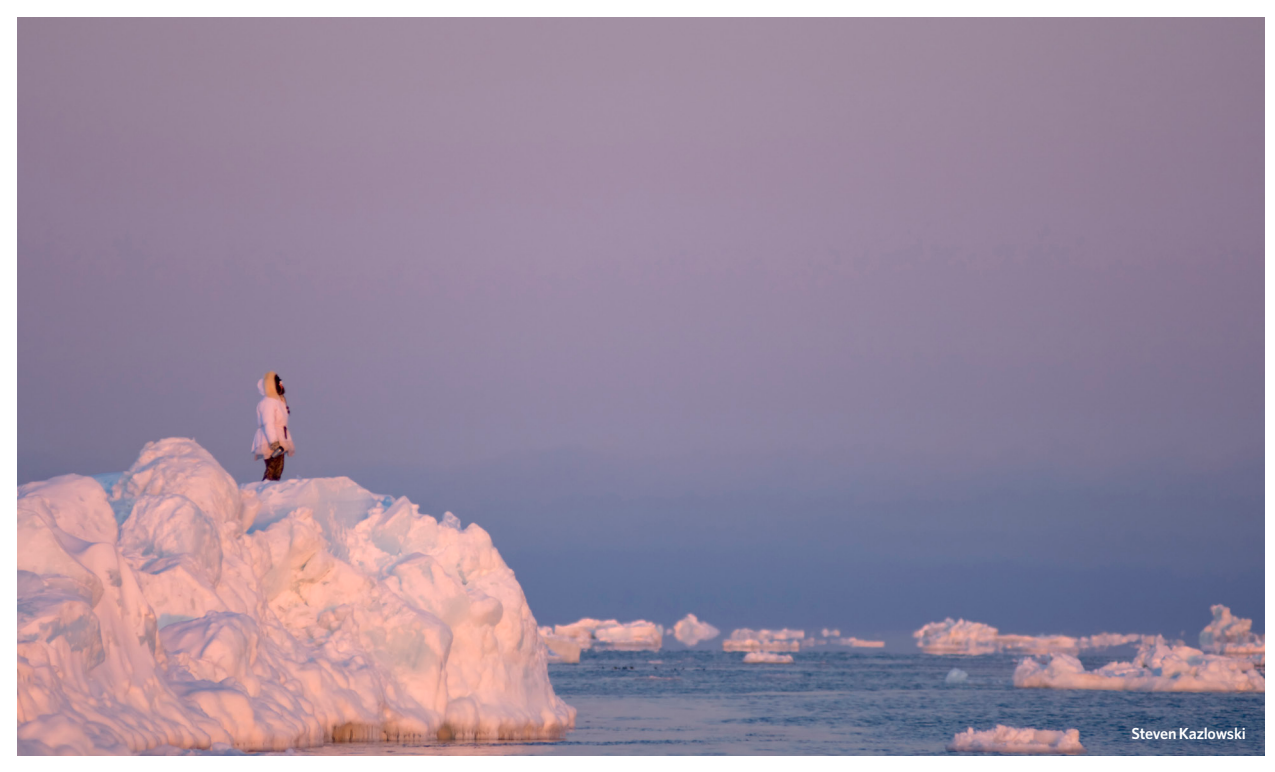
A subsistence hunter observes the seascape at Point Barrow near Barrow Canyon.