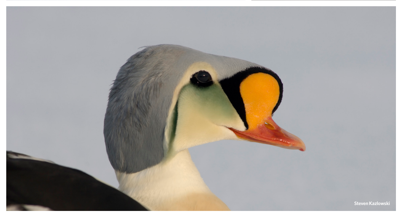
Top Left: The Smith Bay area offers ideal sea ice habitat for ringed seals to build lairs beneath the snow cover. Top Right: Arctic terns are one of many bird species that rely on important habitat in the Harrison Bay-Colville Delta areas. Bottom: The king eider's colorful profile is a familiar sight along the Beaufort Sea coast.