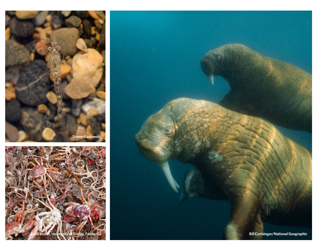
Top Left: Tiny organisms, such as this krill, provide the foundation of the Arctic food web. Bottom Left: Crabs and brittle stars are common members of the benthic community in the Arctic. Right: Pacific walruses, found in large numbers near Hanna Shoal, dive to the seafloor to feed.