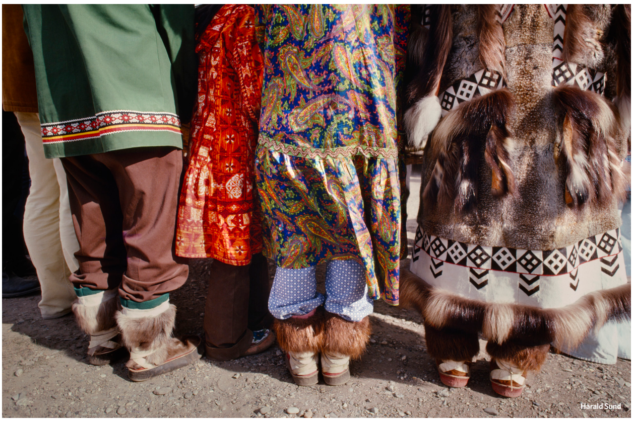
The ocean is integral to many Arctic indigenous communities' way of life.

Oliktok Point to Demarcation Bay areas. The map shows their locations, and the accompanying descriptions outline the remarkable resources as well as the features and geography that characterize them and make them likely to remain vital to the health of the U.S. Arctic, its wildlife, and its people for decades even as the climate changes.