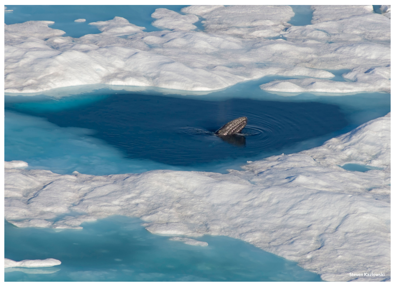
A gray whale surfaces to breathe amid sea ice in the Chukchi Sea.