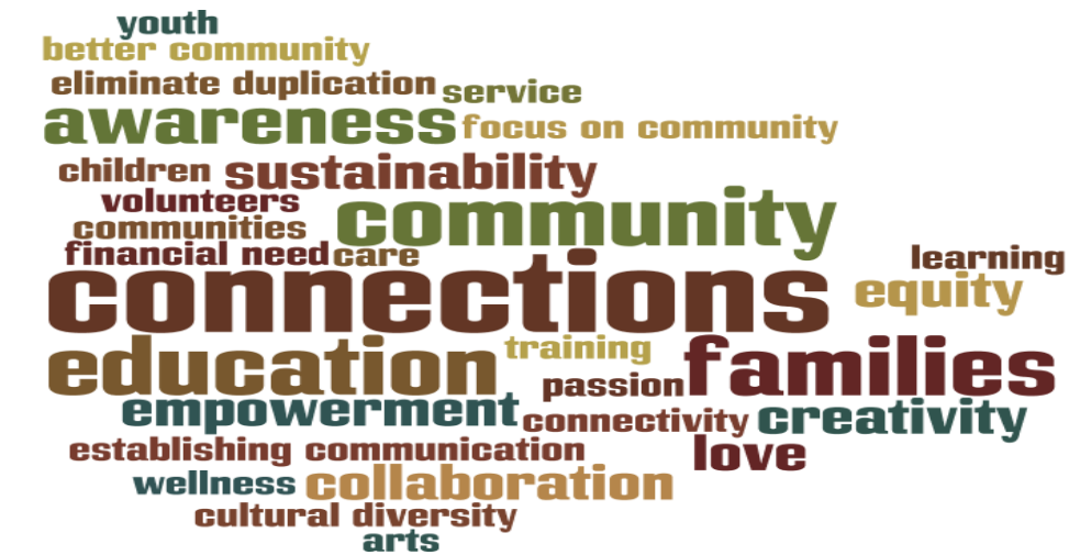
Figure 2. Commonalities

* Wordle<sup>™</sup> created from top 30 most frequently repeated phrases in prompt 2 responses.