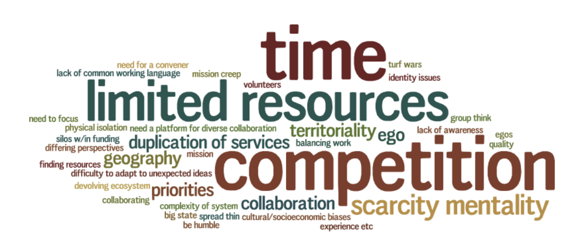
Figure 4. Challenges

In prompt 4, the foundation asked the participants what challenges they faced in achieving the big goals and desires mentioned in prompt 3. Responses reflected two types of challenges: individual and systemic. Responses included some individual challenges: turf mentality and territoriality; lack of resources; and close-mindedness/lack of creativity. Participants noted that collaboration is hard when you are not on the same page/playing field; when there are competitive conditions and disparity in resources between organizations; when there is a lack of systemic, long term support for collaboration (e.g. coordination between funding agencies, training in collaborative practices, enhanced connectivity for rural or remote areas, and opportunities to network and learn together); when there is a need for different entry points into collaboration as a result of different organizational capacities and structures; and when trust requires a structural safety net that does not vet exist (e.g. experimental funding structures, multi-year funding and formative metrics focused on learning, ways to share knowledge and experiences, etc.). Figure 4 displays the 40 most popular phrases and words used by the organizations in the workshops. As the Wordle in figure 4 shows, it is clear that limited time, limited resources, competition, and scarcity mentality are the largest challenges faced by organizations overall.