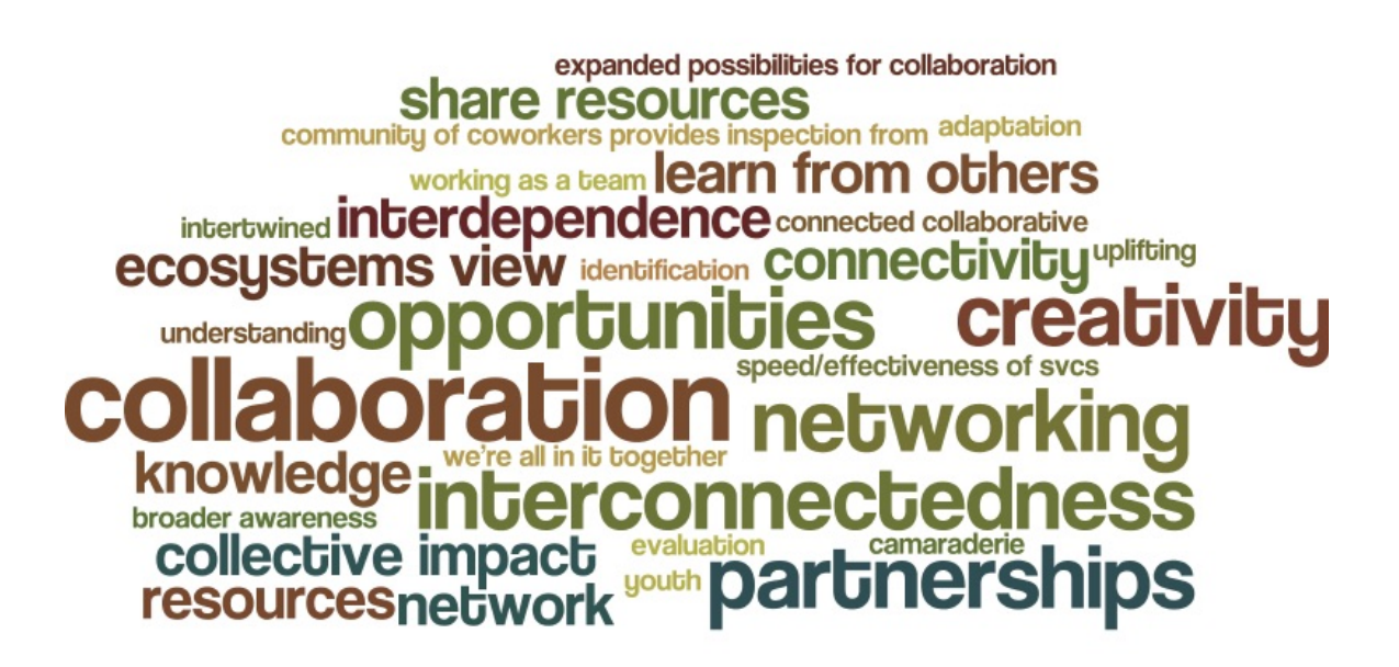
Figure 3. What do we want to achieve?

* Wordle<sup>™</sup> created from top 30 most frequently repeated phrases in prompt 3 responses.