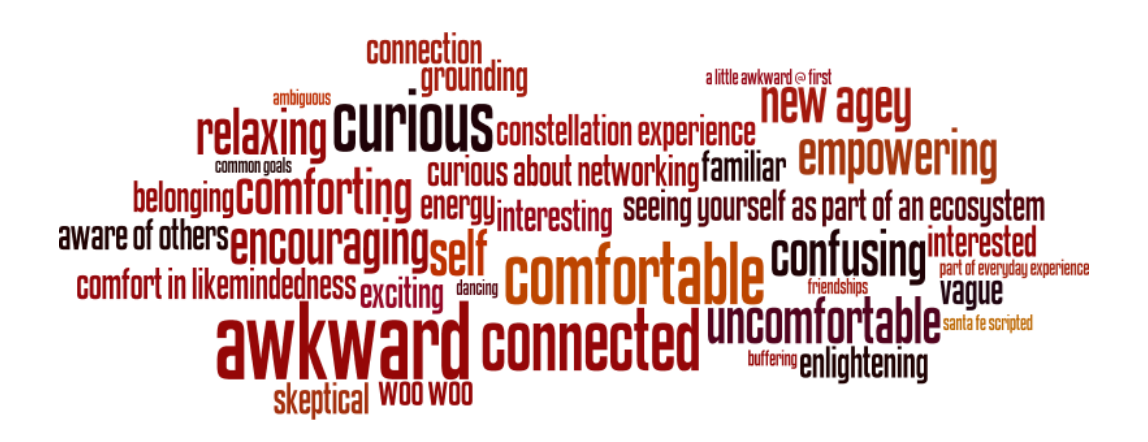
Figure 1. What was the ecosystem activity like for you?

* Wordle<sup>™</sup> created from top 40 most frequently repeated phrases in prompt 1