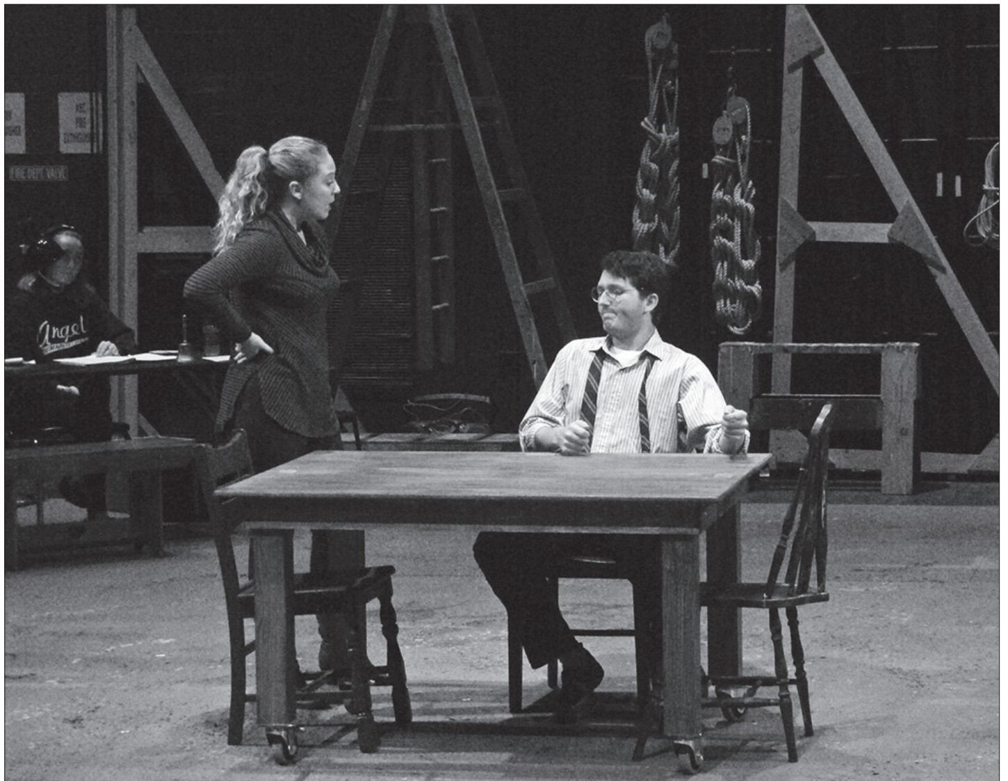
Actors performing a scene from Our Town .

The final performances of Our Town will be from Oct. 28 to 30, so get your tickets now!