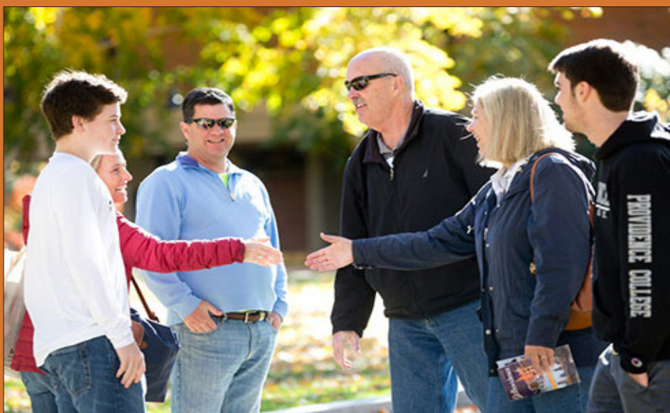
Freshmen students and families will reunite this weekend to celebrate 100 years of PC tradition.

Activities will include pumpkin painting, a baby farm animal petting station, and hay rides. In true fall spirit,