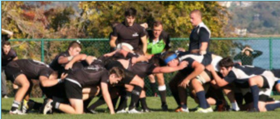
The Backpack enters a scrum.