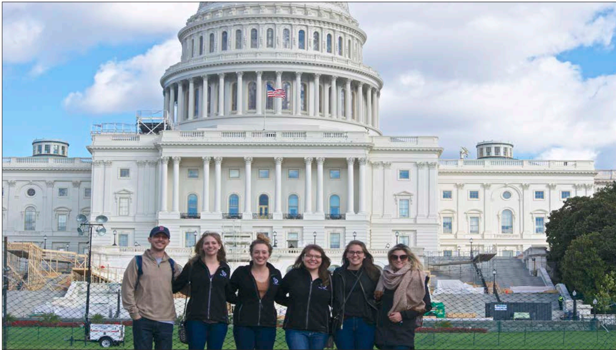
Another shot from outside the Capitol.

This past weekend, Oct. 20-23, I had the privilege of attending the Associated Collegiate Press National Media Conference in Washington, D.C. I attended workshops and lectures by professionals in the industry, including Bob Woodward, Edward Snowden, and various professors.