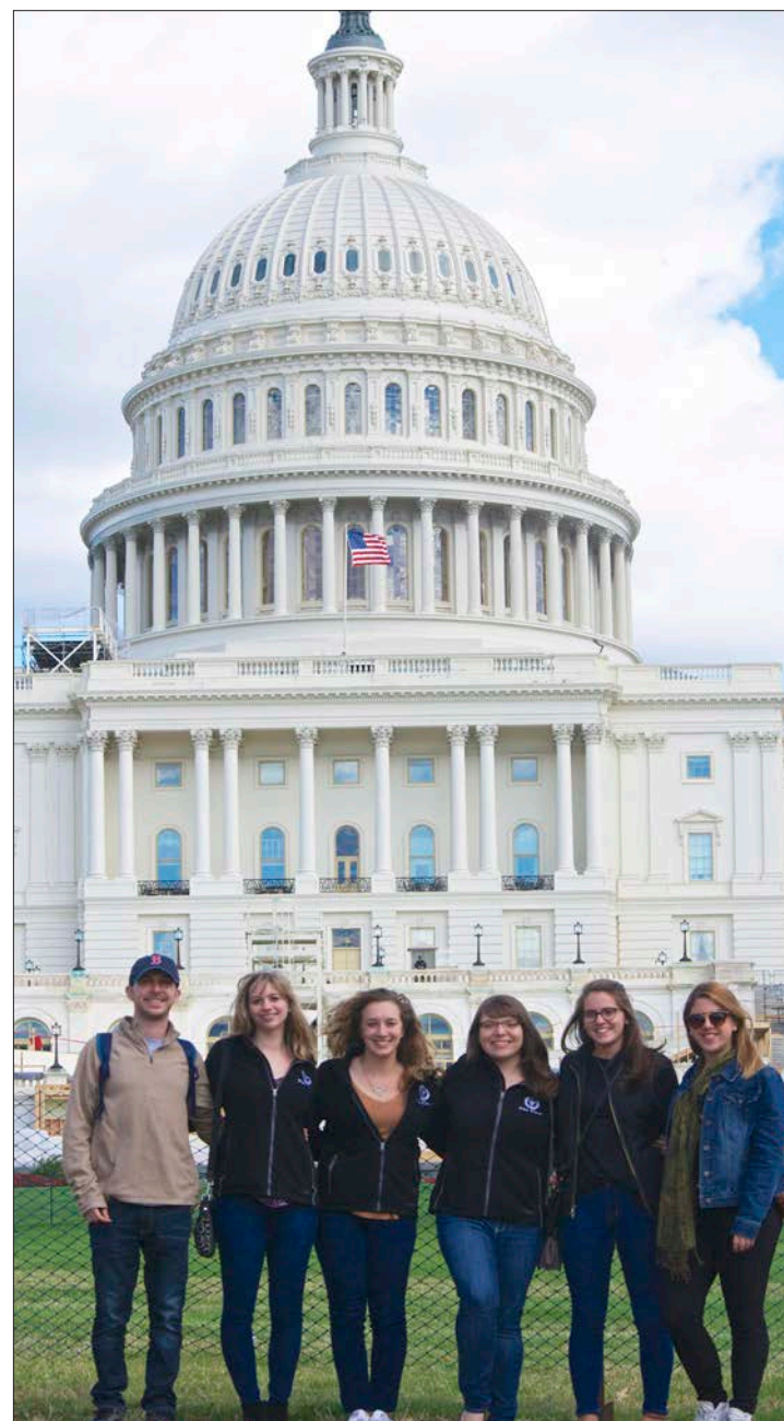
Cowlers enjoy a day of sightseeing and pose in front of the nation's Capitol building.

I did not know what to expect when I decided to attend the trip to the ACP National Media Conference in Washington, D.C. When our plane took off, I was mostly just excited for a weekend away with some people I was already friends with, and some I wanted to know better. I left the conference with more than I expected; I bonded with a group of people beyond the confines of the office and I made connections between the things I learn inside the Providence College bubble and the real world of journalism and beyond.