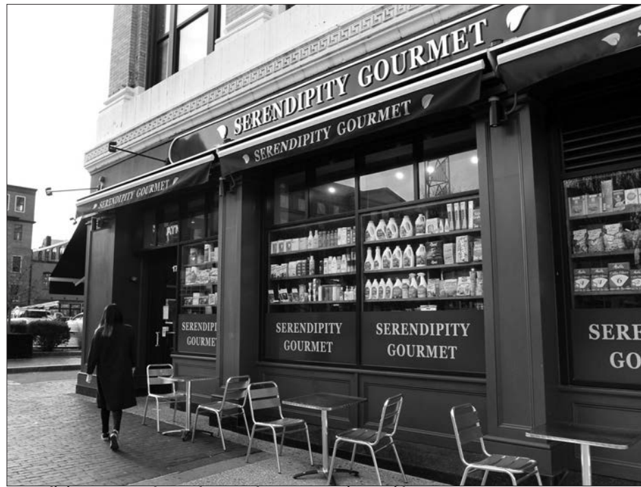
Serendipity Gourmet, located on Weybosset street in Providence.

Let me be clear, this isn't just a deli or just a convenience store. This place has everything, and it is all bundled up