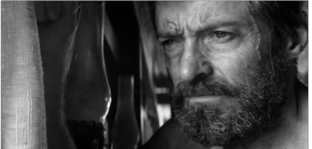
Hugh Jackman as Wolverine in Logan trailer.

The villains of the movie are rumored to be a group of guys called the Reavers. The trailer also begs the question, where did all the mutants go? It wouldn't be ridiculous to assume that the Reavers are out here killing mutants and now have their sights on Old Man Logan.