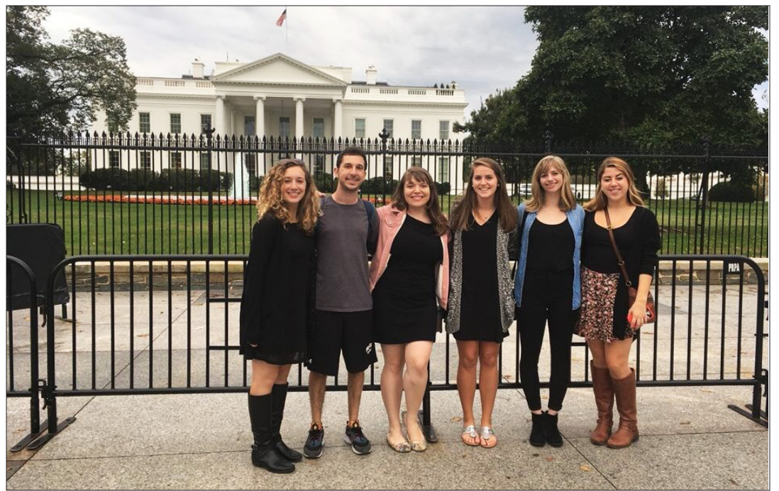
Cowlers hoping for a glimpse of the Obama family outside the White House.

The ACP conference in Washington, D.C. was an extremely informative experience. One of my biggest takeaways was how important it is to have an unfiltered platform for student voices in college journalism. No matter what the workshop subject was, the speakers all stressed the importance of tackling tough subject matter regardless of the potential blowback. The most interesting workshop I attended was titled "Race, Sex, and Gender: How to Write About Tough Topics on a Conservative Christian Campus." The crux of the workshop was that these are important subjects to campus culture and culture as a whole and therefore, they cannot be ignored. Of course, if you attend a Catholic institution, it may be tricky to talk about some of these subjects, but these issues affect the student body and they need to be addressed with tact and respect. We also attended a video conference with Saturday's keynote speaker, Edward Snowden. In the same vein, Snowden stressed the importance of speaking out and standing up for what is important to you. In summary, the conference experience was about learning the importance of finding ways to tackle tough topics, rather than shying away from them for fear of causing offense.