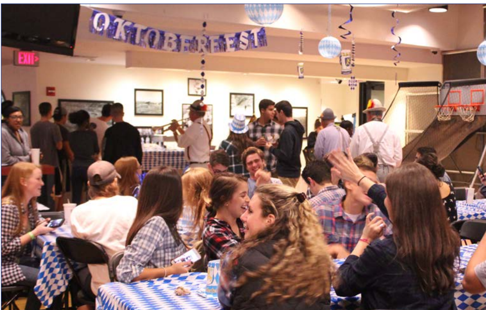
KRISTINA HO '18/ THE COWL