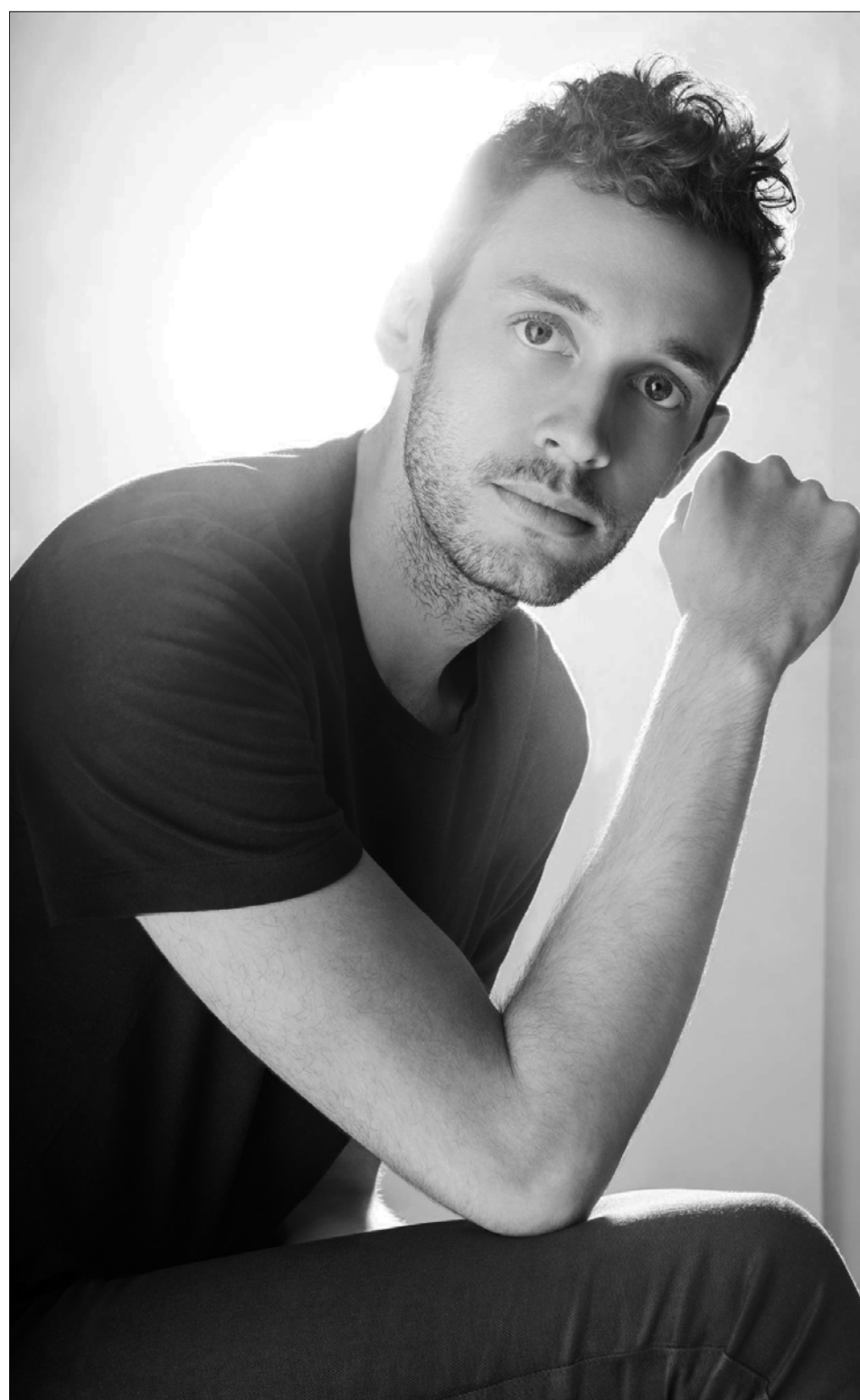
Wrabel poses for a photo.

After his performance, I was hooked and started to explore more of his music. I definitely recommend checking out his EP "Sideways," along with his latest single "11 Blocks," if you're looking for a new, quirky, adorable, and talented artist to follow.