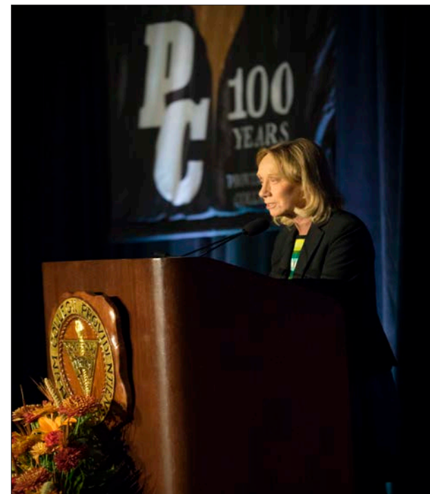
Doris Goodwin addressed a crowd of 300 people talking about "The Presence of the Greatness of the Past."