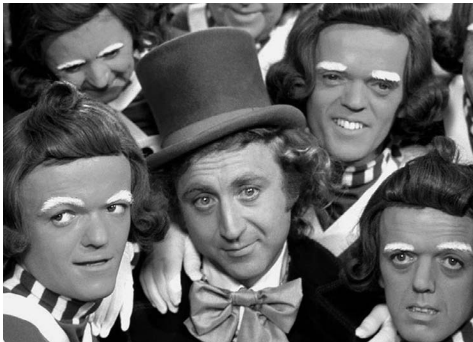
Gene Wilder as Willy Wonka in Willy Wonka and the Chocolate Factory.

Apparently, the news from Warner Brothers has not been received with open arms. Fans immediately pointed out how insensitive it was for Warner Brothers to announce a Willy Wonka reboot within two months of Gene Wilder's death. Wilder is the face that everyone initially pictures when