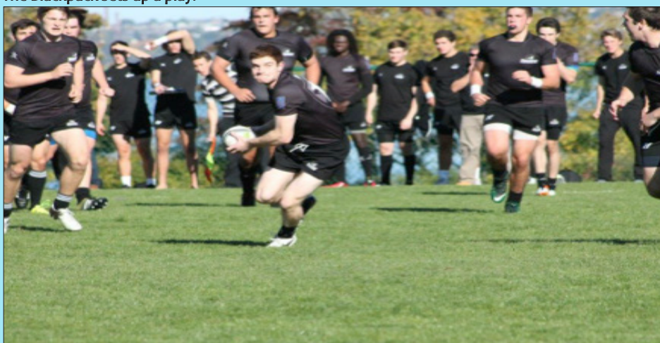
The Backpack moves down the field.