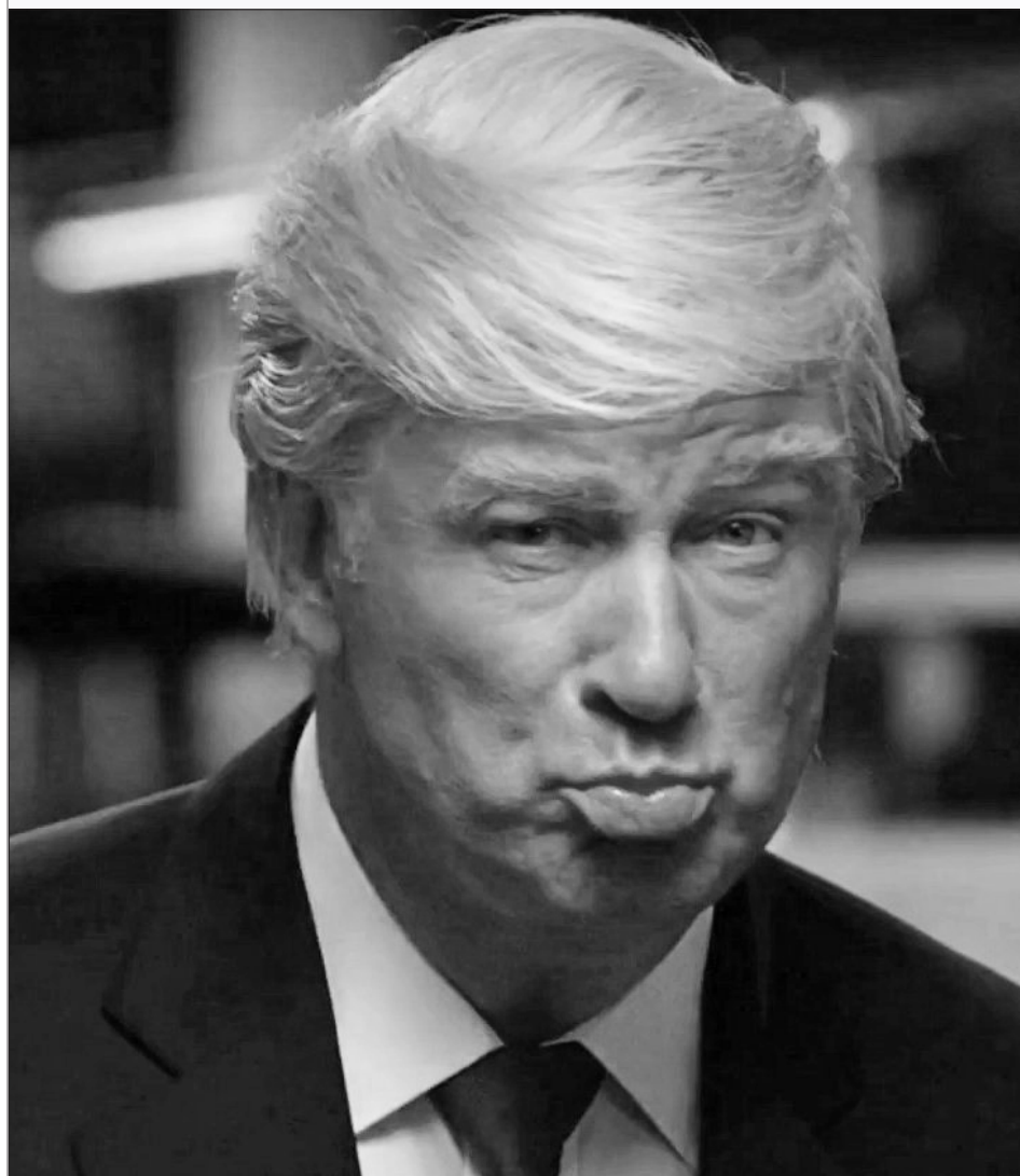
Alec Baldwin poses as Donald Trump.