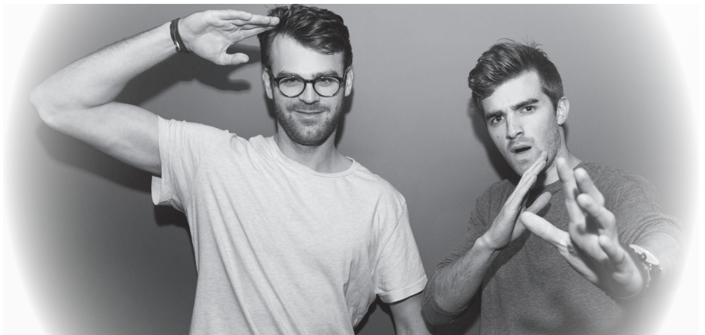
The Chainsmokers pose for a promotional photo.

Recently, the Chainsmokers have communicated to their fans via Twitter that they have no plans to produce an album because it would have to develop a period over time