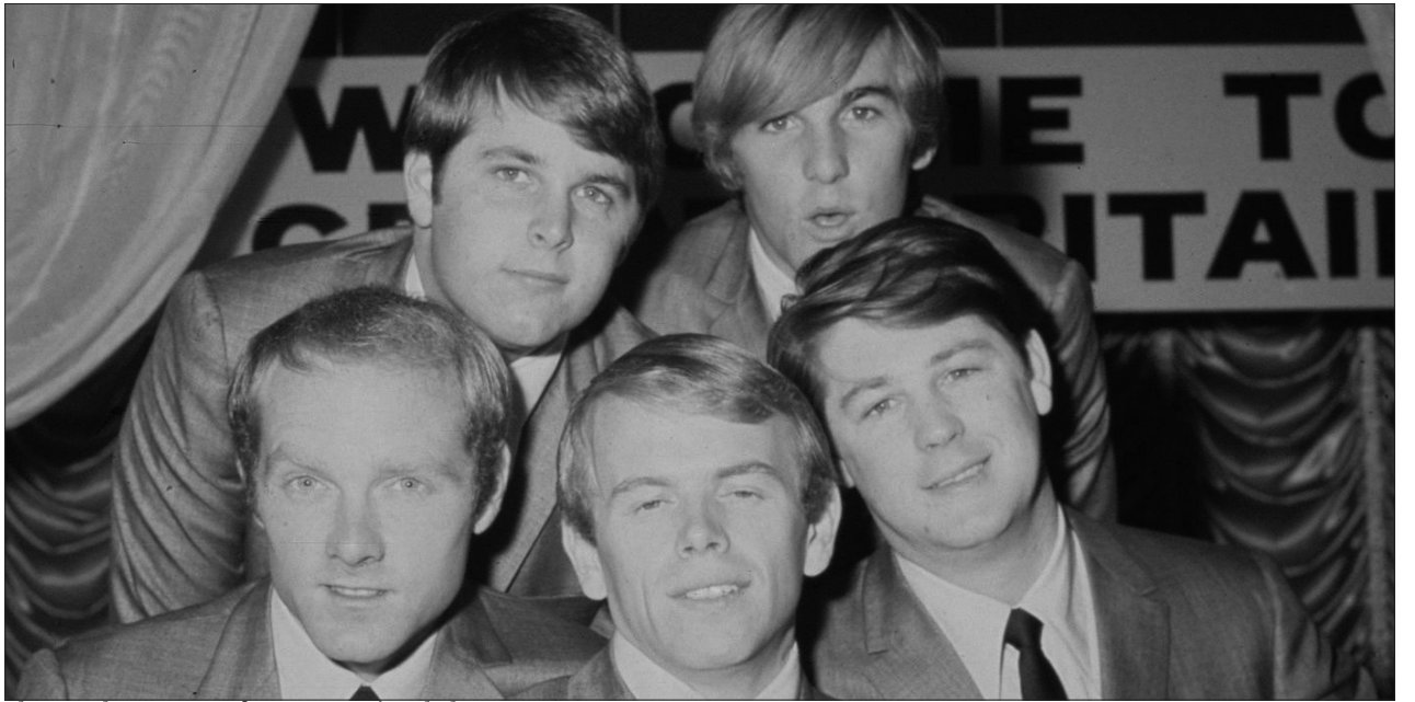
The Beach Boys pose for a promotional photo.

The Beach Boys used a number of unconventional