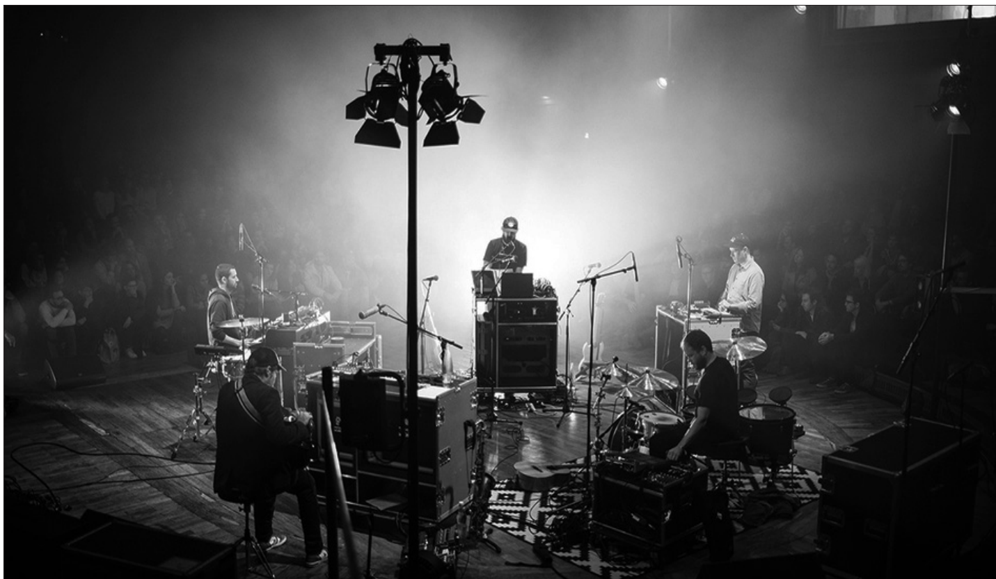
Bon Iver performs in Saal during the Funkhaus Festival.

Maybe the rarity of this music festival preserves the special and inviting nature, and music lovers will be all the more grateful for getting the chance to participate in this unique type of festival.