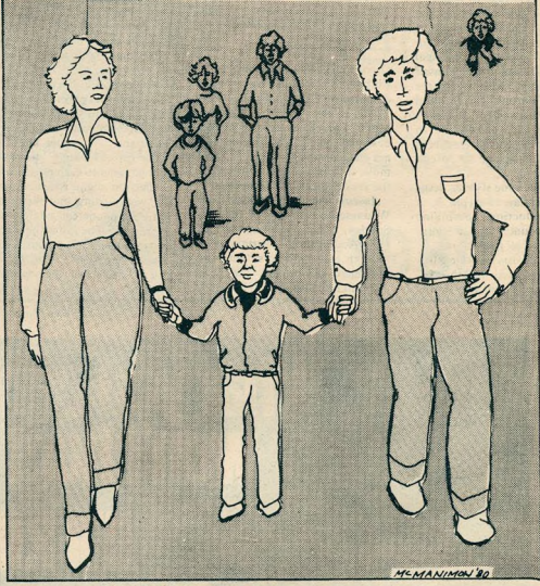
... AN ASSET TO THE COMMUNITY