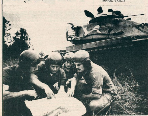
Army ROTC. Learn what it takes to lead.