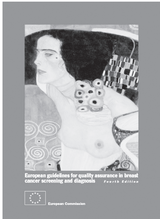
FIGURE 3. EUROPEAN GUIDELINES FOR QUALITY ASSURANCE IN BREAST CANCER SCREENING AND DIAGNOSIS. FOURTH EDITION 12