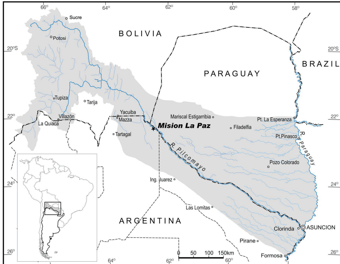
Figure 1. Map of Pilcomayo River basin with the water sampling location (Misión La Paz, Argentina)

waters are located in Bolivia along the eastern flank of the central Andes at an elevation of approximately 5,200 m (Figure 1). The river flows in a southeasterly direction until reaching the Chaco Plains along Bolivia's southern border with Argentina. Its total length is 2,426 km and its basin covers an area of approximately 288,360 km 2 ( http://www.pilcomayo.net/web/ ).