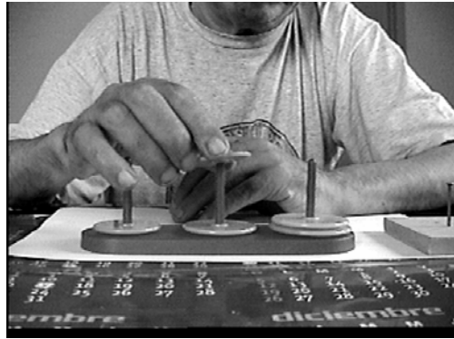
Figure 1. The patient working with the Tower of Hanoi

The treatment followed the theoretical framework of dynamic assessment (Bacigalupe, Lahitte & Tujague, 2011).