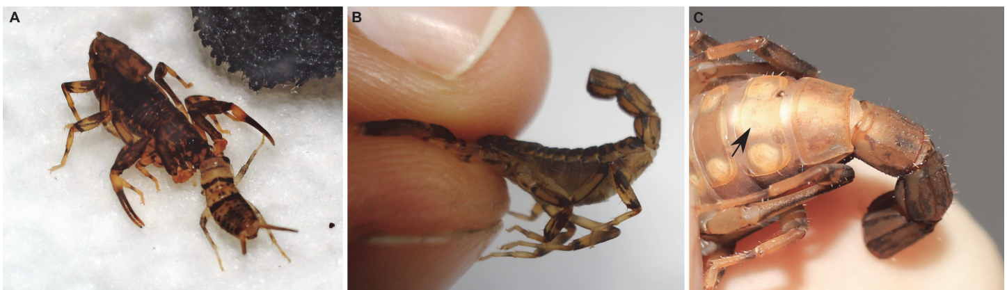
Figure 3. Ananteris solimariae Botero-Trujillo & Flórez, 2011, adult males, twenty-five days after autotomy. A. Feeding on cricket nymph. B. Attempting to sting, showing swollen opisthosoma. C. Accumulated excrement evident as white area inside opisthosoma (arrow).

After autotomy, scorpions attempted to use the remainder of the metasoma to sting prey and for defense, when captured, as if the metasoma and telson were fully intact (Figs. 3A, B). Attempts to attack prey of moderate to large size met without success and these individuals