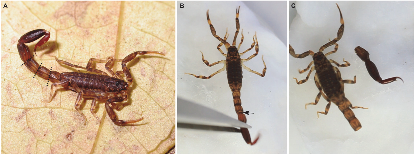
Figure 1. Autotomy in Ananteris Thorell, 1891 scorpions. A. Ananteris balzani Thorell, 1891, adult male from Serra das Araras Ecological Station, Mato Grosso State, Brazil. Dashed lines indicate autotomy cleavage planes between metasomal segments I-IV. B, C. Autotomy in Ananteris solimariae Botero-Trujillo & Flórez, 2011, adult male, video frames. B. Exact moment before autotomy, scorpion fighting to escape. Arrow indicates beginning of cleavage. C. Immediately after autotomy, detached tail twitching.