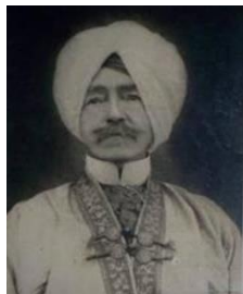
Macauliffe in Sikh dress.