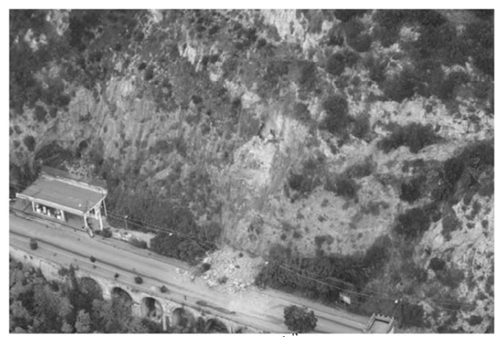
Figure 3. The rockfall occurred on 18<sup>th</sup> February 2014.

Along the entire road stretch linking Vietri sul Mare with Salerno, between 1969 and 2013, 22 rockfalls were inventoried based on the information in the Italian Landslide Inventories (AVI and IFFI Catalogues), historical documents, and newspapers. Some rockfalls of about several cubic metres caused prolonged traffic interruptions. About 13 rockfalls occurred during the period 1993-1997, whereas only five landslide events are reported in the subsequent period up to 2013. Likely, this is due to passive devices (wire nets) which, during that time, were installed along cliffs above the road. Despite the considerable number of recorded rockfalls, there is incomplete information regarding the magnitudes as well trajectories and stopping points. On 18th February 2014, a new rockfall of about 40 m<sup>3</sup> affected the road at the kilometer 51+300 (Figure 3).