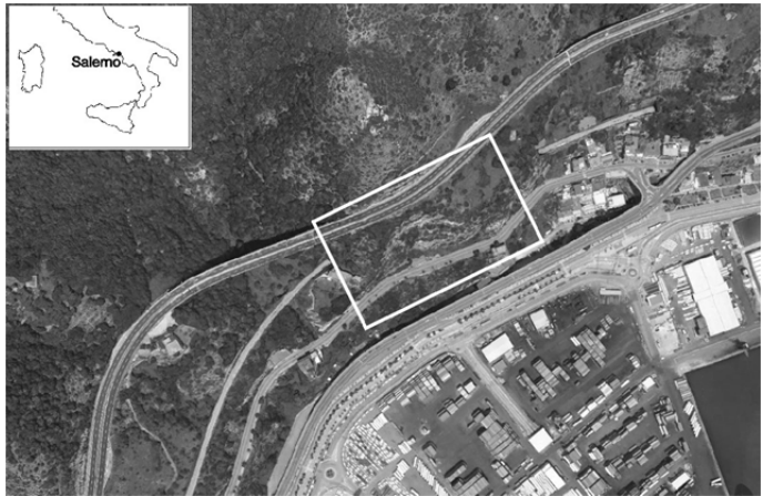
Figure 2. The harbor of Salerno and the surrounding hills. The white rectangle shows the study area.

The studied road crosses a coastal area characterized by high reliefs lying near the harbor of Salerno (Fig. 2). Given the near vertical cliffs and very steep slopes, in a short distance from the coast, the relief goes from the sea level to heights greater than 700 m ASL. On slopes flanking the road, heavily fractured dolomites rocks outcrop. Some low-angle normal faults and several pervasive mutually intersecting joints affect the rock mass. These joints identify wedges whose lines of intersection are almost normal to the cliff face. Other randomly oriented deep tension cracks are caused by tensile stresses along cliffs. The intersections of these joints with the cross-bedded dolomitic layers result in isolated, potentially unstable boulders. Almost vertical slopes contribute to the free fall of boulders on the road,