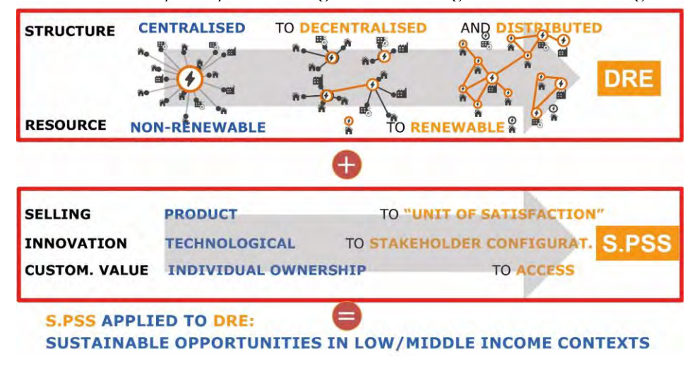
[Figure 2] S.PSS applied to DRE a sustainable opportunities for all

"A S.PSS applied to DRE is a promising approach to diffuse sustainable energy in low/middle-income contexts (for all), because it reduces/cuts both the initial (capital) cost of DRE system purchasing and the running cost for maintenance, repair, upgrade, etc., while increasing local employment, related skills and entrepreneurship, resulting in a key leverage for a sustainable development process aiming at democratizing the access to resources, goods and services."