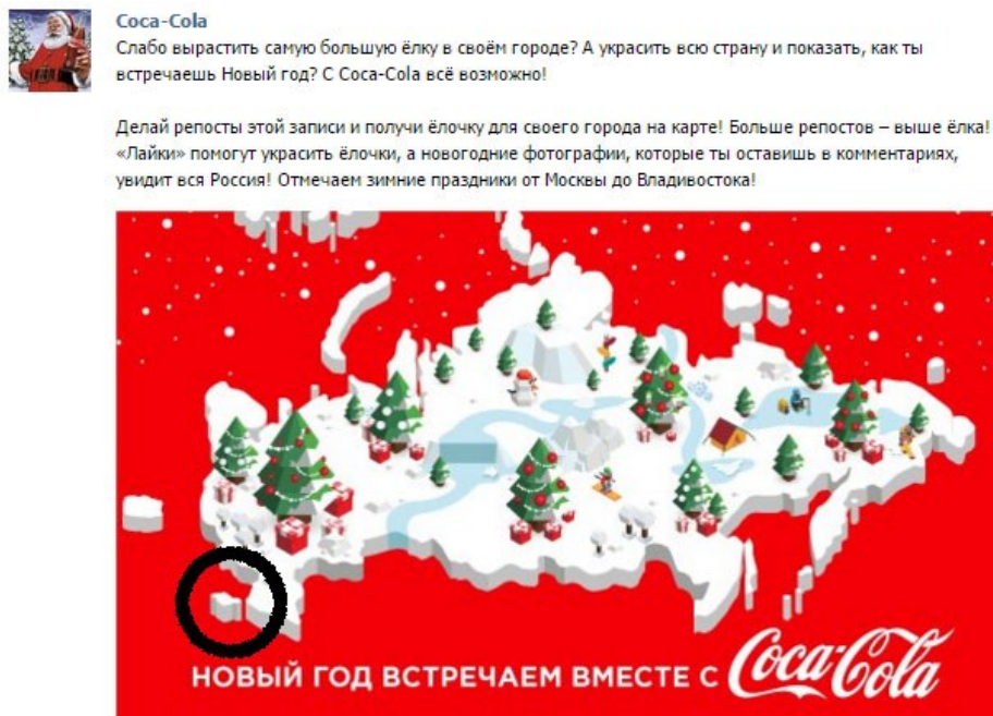
Figure 3. Bring in the New Year with Coca Cola (second version).