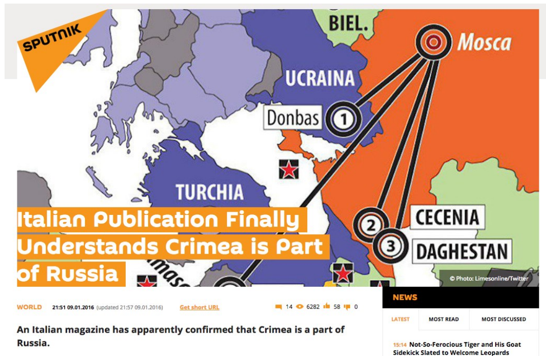
Figure 4. Italian Publication Finally Understands Crimea is Part of Russia.