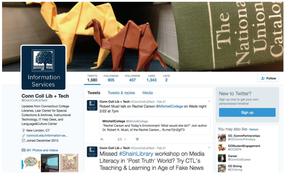
INFORMATION SERVICES' TWITTER ACCOUNT POSTS ABOUT EVENTS AROUND CAMPUS, AS WELL AS AN ARRAY OF TOPICS RELATING TO LIBRARIES AND TECHNOLOGY.

es and the ways in which they use them, such as the ongoing "Humans of Shain" initiative.