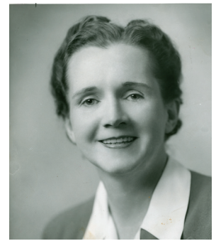
THE LIBRARY HOLDS NUMEROUS GOVERNMENT DOCUMENTS RELATED TO RACHEL CARSON; PICTURED IS HER STAFF PHOTO FROM THE U.S. DEPARTMENT OF THE INTERIOR'S FISH AND

eth century on all agricultural topics imaginable, these wonderful pamphlets are unquestionably treasures, many with fascinating covers to boot. They are "hidden" in the sense that the Farmers' Bulletin is