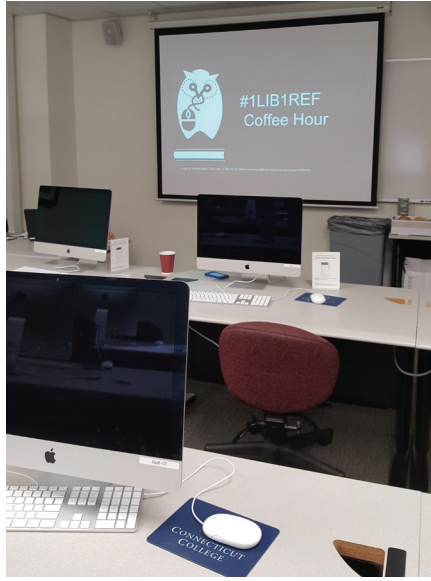
IN FEBRUARY, A GROUP OF THE COLLEGE'S LIBRARIANS PARTICIPATED IN WIKIPEDIA'S ##1LIB1REF INITIATIVE TO HELP TO IMPROVE THE ONLINE ENCYCLOPEDIA'S QUALITY AND SCOPE