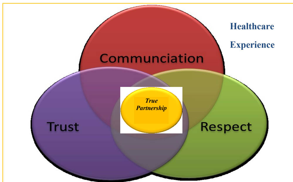
Figure 1 Model of relational subthemes important to a true partnership.

This model represents a strong visual representation of true partnership that can be utilized in any area of nursing where nurses work with clients to enhance the healthcare experience.