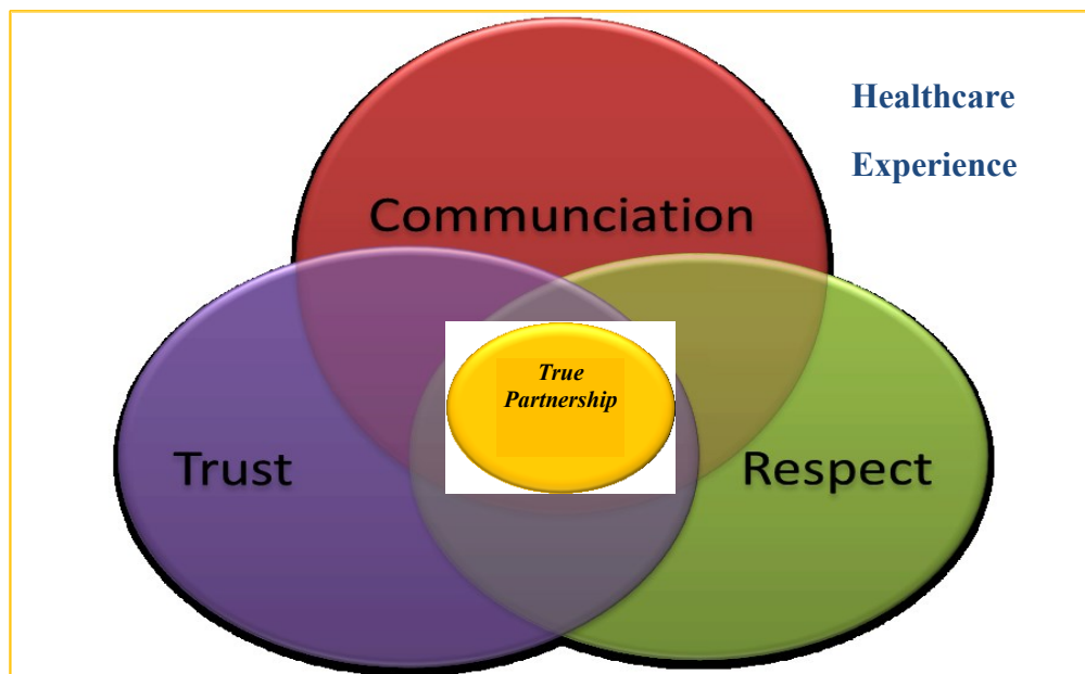
Figure 1 Model of relational subthemes important to a true partnership.

This study's findings can be visually represented in the following visual model, based on a Venn diagram representation of linked subthemes, to illustrate the conceptual theme of true partnership .