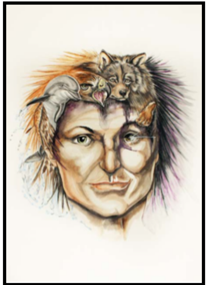
PAINTING BY ANONYMOUS PARTICIPANT, SELF- PORTRAIT, 2015, MIXED MEDIA ON PAPER, 14” X 18”

— Participant, California Institution for Women (CIW)