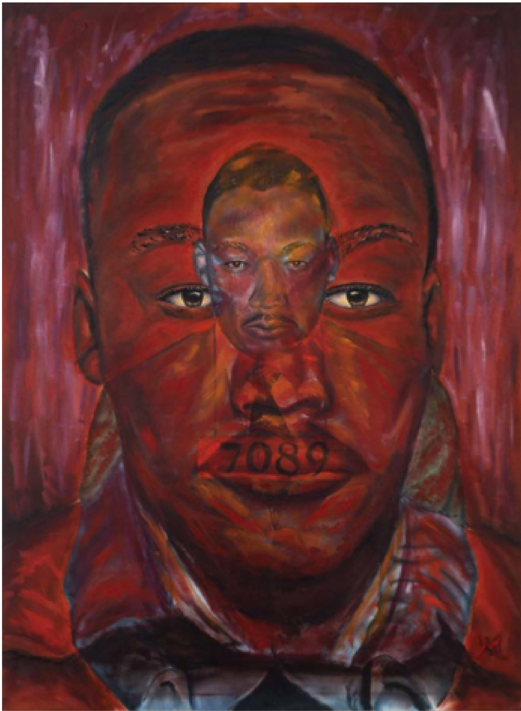
“FEARLESS MARTIN,” S. SAIBU, 2016, ACRYLIC ON CANVAS, 2' X 4,' FROM “THROUGH THE WALL: PRISON ARTS COLLECTIVE” (ARTWORK BY PARTICIPANT IN PROGRAM)

“It has been an adventure with creativity at the helm. We were given options outside of our experience and comfort zone learning to experiment with new techniques.”