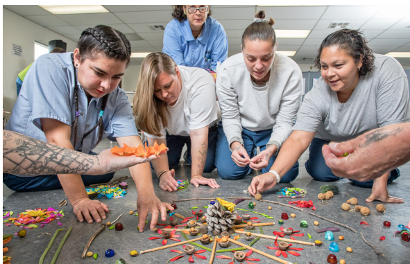
PROGRAM PARTICIPANTS AT CIW CREATE A COLLABORATIVE MANDALA.

Philosophy: CBA and the Prison Arts Collective recognize that crime damages human relationships and disrupts a harmonious social structure; we believe that art can offer opportunities to heal, mend, and grow. Our programming is guided by collaboration and a community-minded approach. Moving beyond the victim-offender paradigm, CBA engages principles of restorative justice to provide an alternative based on consensus-building in which individuals gain opportunities for self-expression and learn to live together in safer, healthier environments.