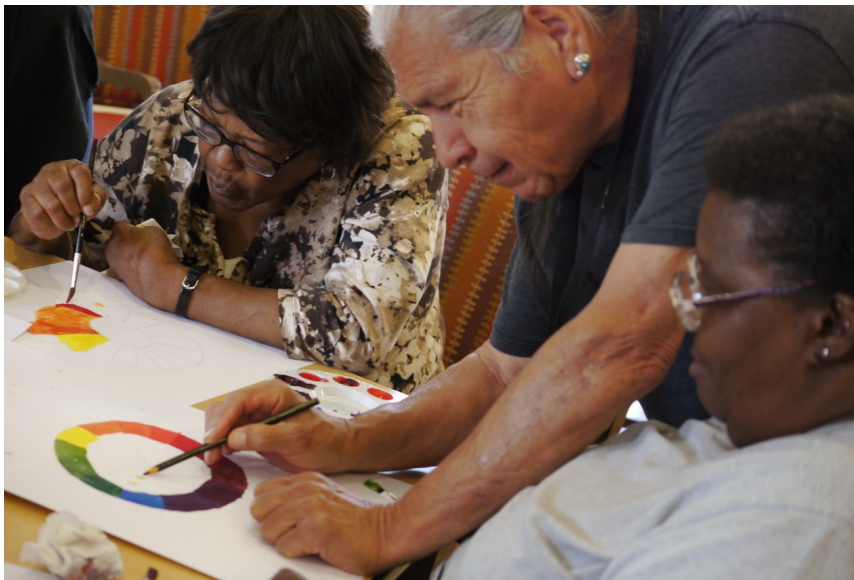
CBA PARTICIPANTS AT ENGAGE FOCUS ON LEARNING THE COLOR WHEEL.

We want to bridge societal gaps in understanding others through art. In addition to supporting positive change through art within our community partner sites, we share art-work created by participants with the public through exhibitions and publications.