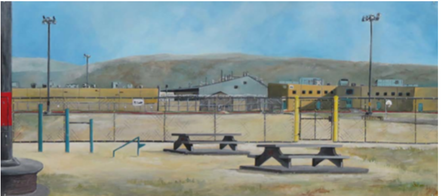
“COUNT TIME,” C. BRANSCOMBE, 2016, ACRYLIC ON BOARD, 16” X 36,” FROM “THROUGH THE WALL: PRISON ARTS COLLECTIVE” (ARTWORK BY PARTICIPANT IN PROGRAM)