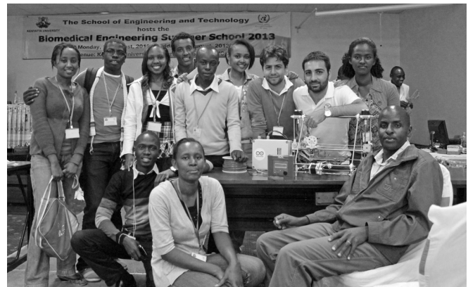
Fig. 2. The Innovators' Summer School 2013, at Kenyatta University

There was also interest in the regulatory aspects and standards in medical devices. As the participants were from different backgrounds, many had very little idea what medical devices are and the critical importance of safety issues in such devices. The action thus served to bring home the importance of this aspect during the design of instruments for BME. To encourage safe design and innovation, the summer school ended with a student project competition organised by ABEC. With the help of lecturers and mentors, students were encouraged to spend the next year working on their own ideas for presentation at the following summer school.