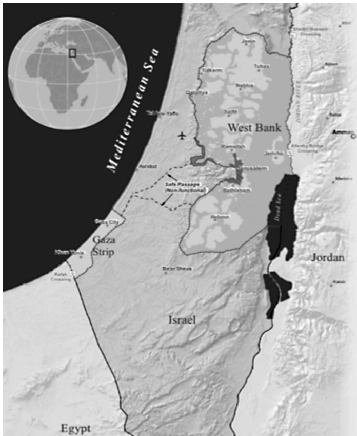
Figure 1 - The Gaza Strip on the map.

WFP 4 , World Bank, FAO 5 on the humanitarian effects of this issue. From these various analyses it emerges that the protracted crisis has deeply impacted the society, the economy and the environment of the occupied Palestinian territory (oPt).