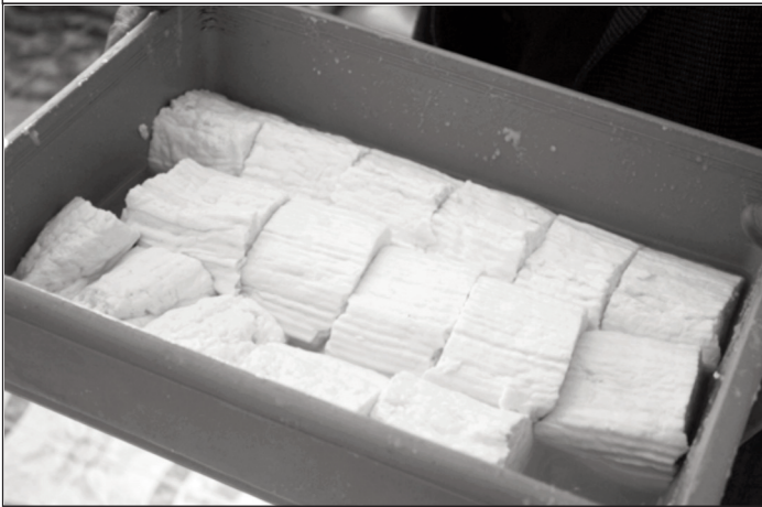
Figure 4 - The picture shows a kind of cheese made at household level in the Gaza Strip. This cheese is commonly known as white cheese.

Local dairy products are almost totally marketed along informal channels that are unstable. Despite it could represent an advantage for smallholders, trading the dairy products at the base of the pyramid of consumption in Gaza seems to be a “dirty job”. The profit margin is very low and the scale of economy remains too small for the growth and development of a real market. This marketing approach, based on price competition, seems relatively suitable for smallholders that are usually producing their own cheese at household level and marketing directly to end consumers, mostly in their area of residence. On the other hand, breeders with a bigger economy of scale are able to produce more than they can process and market. As a consequence, they tend to find a relation with one of the dairy factories available in Gaza.