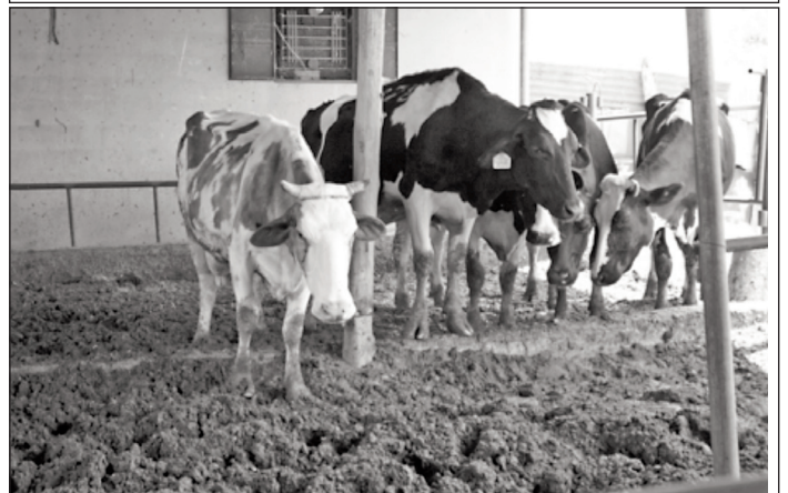
Fig. 3 - The picture shows the poor breeding conditions of dairy cattle in the Gaza Strip. Cattle try to emerge from the mud that surrounds them and prevents movement.

In general, all farms have a cattle feeder while only larger farms have also a milking area that is usually poorly managed.