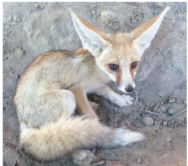
Fig. 3. Adult male Rüppell's Fox Vulpes rueppellii , a carnivore confined to the desert habitat in western Iraq.

RR: c. 30 km south of Rahaliya – Karbal'a desert (An-14) (Fig. 3).