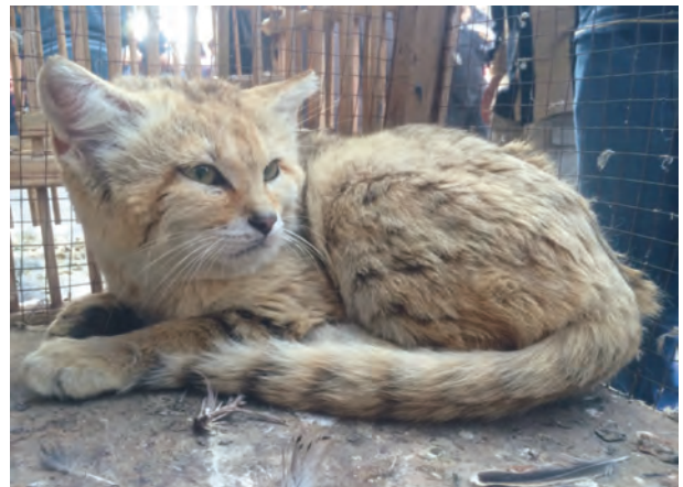
Fig. 4. Adult male Sand Cat Felis margarita trapped in Muthana Province in south-western Iraq.

Caracal Caracal caracal (Schreber, 1776)