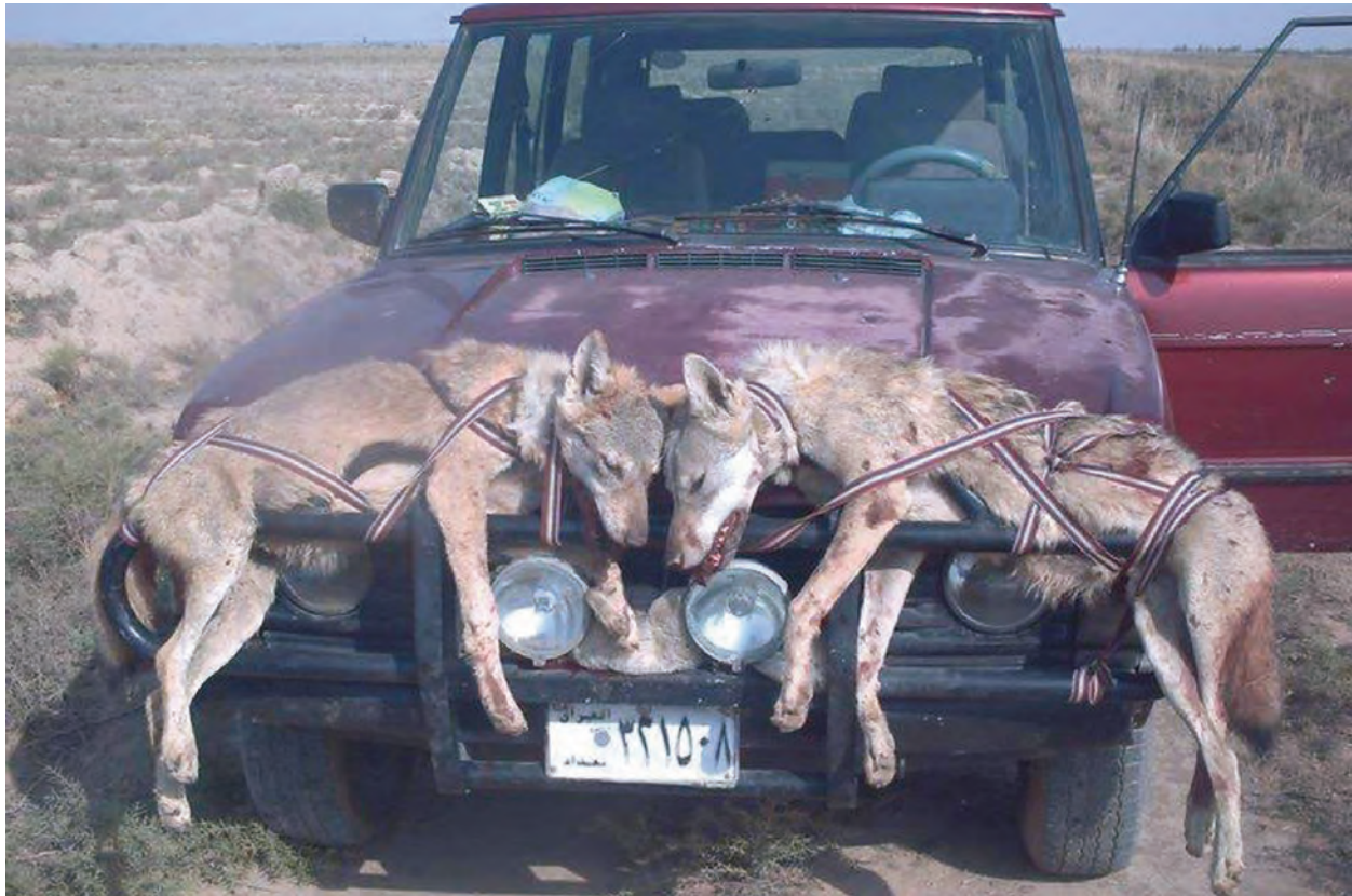
Fig. 2. Wolf hunting in Iraq, Photo © Hameed A. Al-Habash/ Iraqi Hunting Association.

Nasiriya (Sanborn 1940); Qalat Salih and Al Miqdadiyah (Nader 1971; Harrison & Bates 1991).