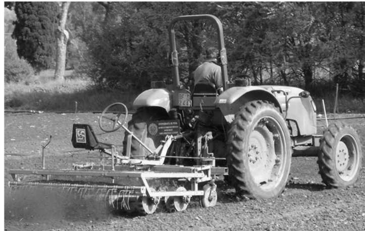
Figure 1: Rolling harrow at work before crop planting

The flaming machines control weeds by the use of an open flame. In these experiments they were equipped with 25 or 50 cm wide rod burners, for a total working width ranging from 1.5 m (in carrot and garlic) and 2 m (in fennel) (Figure 2). This treatment has the advantage of eliminating weeds without stimulating new emergence, because the soil remains undisturbed. The machine is equipped with common 15 kg LPG tanks placed into an on purpose made hopper (Peruzzi et al., 2007). Furthermore, these machines are also equipped with an innovative heat exchange system, in order to avoid thanks cooling during the flaming treatment (due to the LPG passage from liquid into gaseous phase). It consists in heating the water contained into the hopper utilizing the emissions coming from the tractor exhaust head.