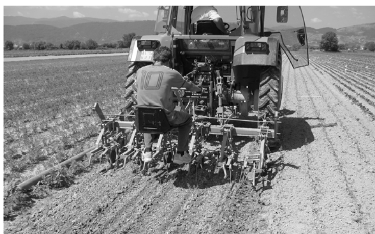
Figure 3: Precision hoe at work in fennel

The precision hoeing machine is characterized by a 2 m wide frame and was equipped with 6 rigid elements for inter-row cultivation (a central “foot-geese” tool and two side “L” shaped sweeps or discs) and elastic elements for intra-row selective weed control (torsion weeders and vibrating tines) and a guidance system consisting in a seat, steering handles and directional wheels (Figure 3). The vibrating tines, which work in vertical position, have their longer segment bent at several points in order to till very close to the crop row (Peruzzi et al., 2007). The torsion weeders, on the other hand, work in horizontal position; a torsion spring enables the tines to flex when they meet a fairly developed plant (generally a crop plant but it could also be a large weed) that opposes resistance to the implement action (Peruzzi et al., 2008a). The position of both tools can be modified according to the treatment aggressiveness required. Treatment becomes more intense when the tines are positioned close to the row crop. The inter-row distance was set to 0.45 m for fennel and 0.20 m for carrot and garlic. Average working speed was about 2 km h -1 and working depth was about 4 cm (Peruzzi et al., 2008b).