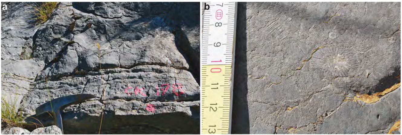
Views of the Vinz Formation in the field; a) Facies A and B: Freikofel A section; b) Facies A: particular of a coral-bearing bed, Cellon Section.