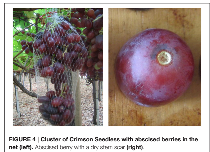
FIGURE 4 | Cluster of Crimson Seedless with abscised berries in the net (left). Abscised berry with a dry stem scar (right).

Means followed by different letters in each column and for each date are significantly different (REGWQ, P \leq 0.01 ). 1 Eth 10, ethephon at a concentration of 1445 mg/L; 2 Eth 20, ethephon at a concentration of 2890 mg/L; 3 values in N.