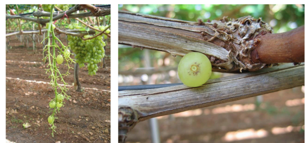
FIGURE 3 | Cluster of Thompson Seedless after the removal of the net to collect the abscised berries (left). Abscised berry with a dry stem scar (right).

Means followed by different letters in each column are significantly different (REGWQ, P \leq 0.01 ). 1 Eth 10, ethephon at a concentration of 1445 mg/L; 2 Eth 20, ethephon at a concentration of 2890 mg/L; 3 values in N.