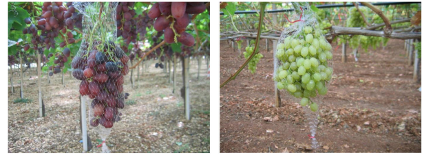
FIGURE 1 | Mesh bags to prevent pre-harvest berry loss of Thompson Seedless (right) and Crimson Seedless (left) table grapes.

Ethephon residues were determined according to the method proposed by Takenaka (2002). For each treatment 30 berries were randomly collected from 10 clusters, stored in a portable