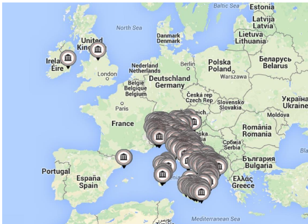
Fig. 2: #InvasioniDigitali 2015 edition in Italy and Europe

#InvasioniDigitali is a project unique in its kind for its scale, interactivity, novelty and effect on cultural digital communication: becoming both a sort of “national-territorial lab” for new social and digital communication products and models, and a tool to enhance visitor’s experience and museum/cultural site performance, it has been recognized as best practice (Symbola and Unioncamere 2013: 201), in that it fits the participatory museum model (Simon 2010).