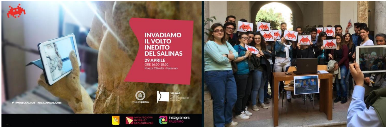
Fig 4: event leaflet and engineering class students at the museum.

The first location was the “Antonino Salinas” Archaeological museum in Palermo, one of the most important archaeological museums and the oldest public museum in Sicily. The invasion focused on the exhibition “ Like - Restoration and shots. Salinas’ unreleased face ” (fig. 4), a selection of newly restored archaeological objects from the museum’s collections.