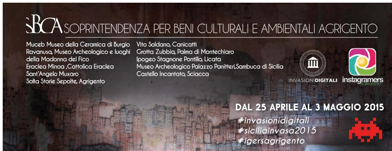
Fig. 3: The advertising flyer for local invasions organized by Agrigento Superintendence of Cultural Heritage.

Since the first Invasion, many cultural institutions have become organizers of digital invasions; for example, during the last Invasion, the Superintendence that locally manages and protects the cultural heritage of Agrigento organized 11 invasions in archaeological and cultural sites normally closed to the public (fig. 3).