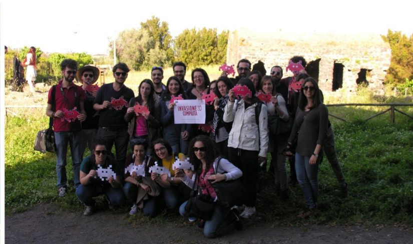
Fig.7: the event leaflet and engineering class students at the end of the 3D digital invasion.

About thirty students from the Building Engineering-Architecture degree course, University of Catania, were involved. The event was planned among the activities of the Digital Drawing course as a practice exercise on Structure from Motion Techniques for 3D documentation of cultural heritage.