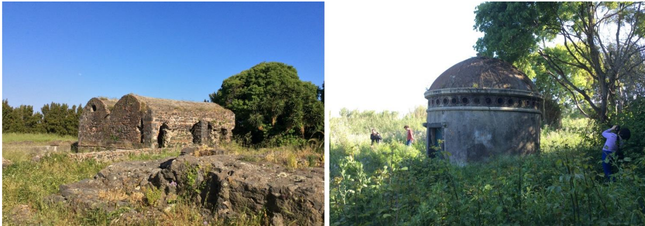
Fig. 8: view of the two buildings in the archaeological area.

The students carefully worked for about three hours in order to obtain at least one small object and one monument dataset. They used reflex, bridge and compact cameras with various images resolutions. Several problems linked to the specific features of the objects (too small, too big) arose during the acquisition. However, the 3D models obtained were of high quality except for the parts that were impossible to shoot from the ground.