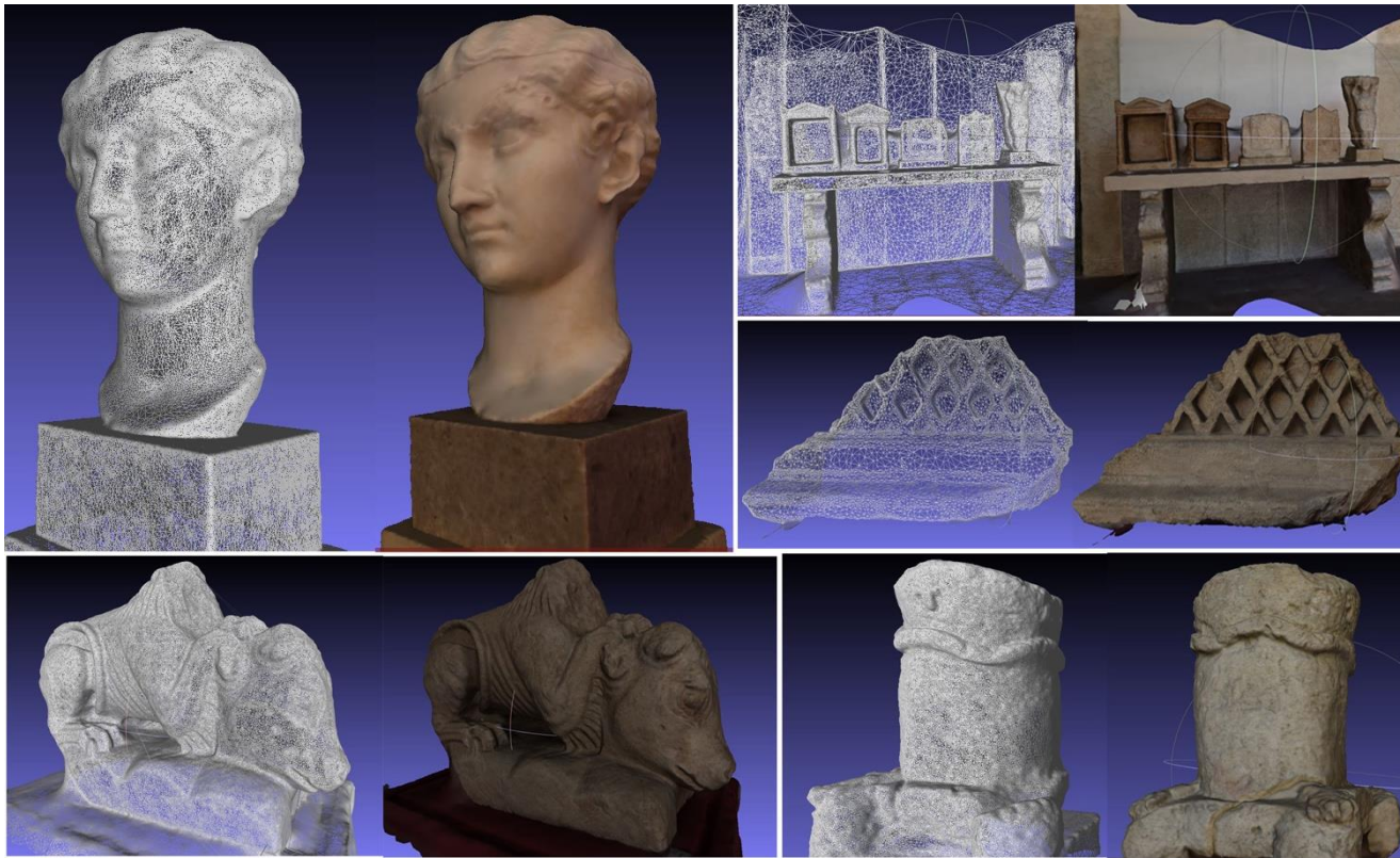
Fig 5: 3D models obtained by data set made with reflex camera.