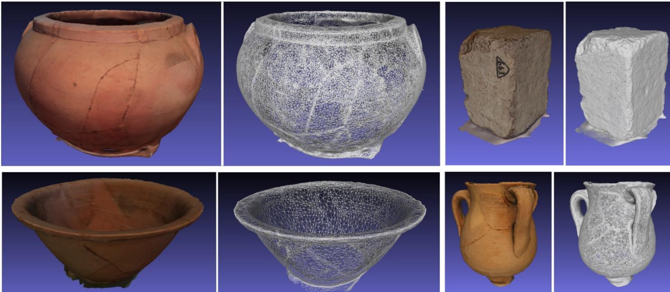
Fig. 10: 3D models of the artefacts both in textured and in wireframe mode.

Most of the students had an immersive and holistic experience in shooting and creating a 3D model of the chosen artwork, many of them critically approached the possibility given by 3D technologies for visits to the cultural site. For all of them this experience was particularly engaging and productive because for the first time in their lives they created cultural content during the visit to a museum.