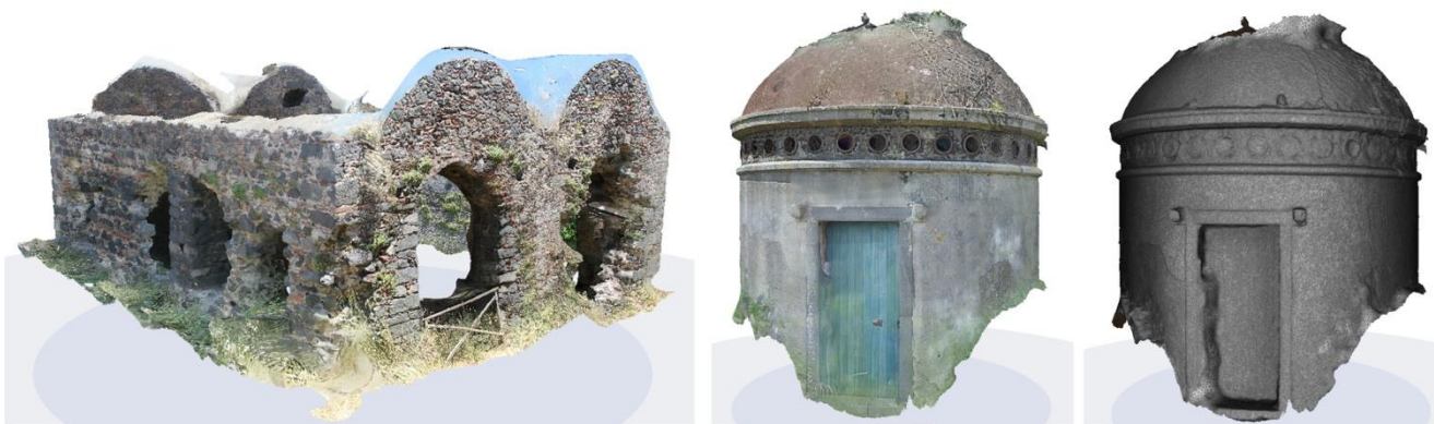
Fig. 9: 3D models of the thermal baths exterior and the second cistern both in textured and in wireframe mode.

In the figures below you can observe the buildings (fig. 9) and the artefact 3D models (fig. 10).