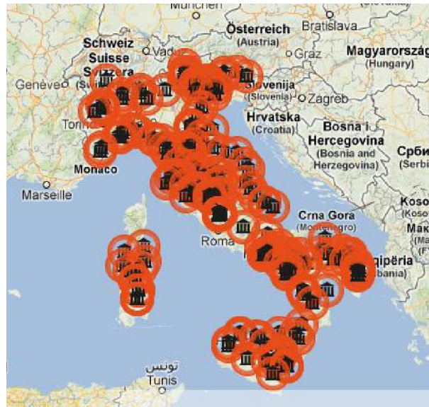
Fig. 1: #InvasioniDigitali 2013 edition