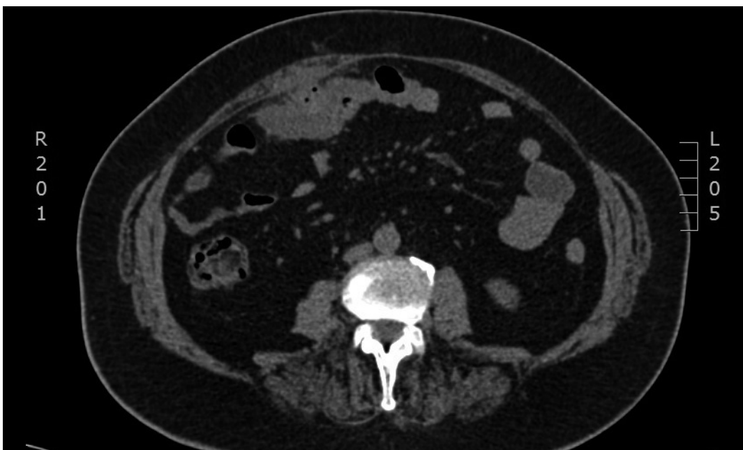
Fig. 1 - CT image of perforation.

In 1975 Ponsky and King were first Authors to talk about the endoscopic tattooing of the colon with India ink (4). The tattooing technique has been experienced for the first time in 1989 on dogs; India ink, Methylene blue, and Indocyanine green and other eight agents were compared. This study showed that methylene blue had an excellent staining, but at the same time it was not long-lasting (about 24 hours). Instead the Indocyanine green and the India ink remained visible on the serosal surface over 48 hours, but the second one can cause a significant inflammatory infiltrate with micro-haemorrhage and thrombosis (5). Anyway Nizam et al. in a review of 447 cases (1996) of colonic tattooing with India ink confirmed that this inflammatory reaction is responsible of only 0,22% of post tattooing complications, moreover other different retrospective studies demonstrated the safety and the efficacy of this long-lasting India ink tattooing (6-8). In order to reduce the risk of complication, some different colonoscopic tattooing technique have been proposed. The first one is the saline