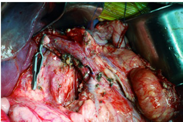
Fig. 3. The primary tumor has been completely resected with pancreaticoduodenectomy. Resection line of the superior mesenteric vein (arrow). The right hepatic artery (arrow-head), replaced from superior mesenteric artery. PV, portal vein; PS, pancreatic stump.

According to the pathological changes described above, the current method used for isolated Roux-en-Y reconstruction has a physiological basis. Our method of reconstruction has been successfully used in more than 80 adults [17] and now appears to be a safe and effective procedure for children. Our method for Roux-en-Y reconstruction leaves the patient closer to normal human digestive physiology than prior techniques and thus might