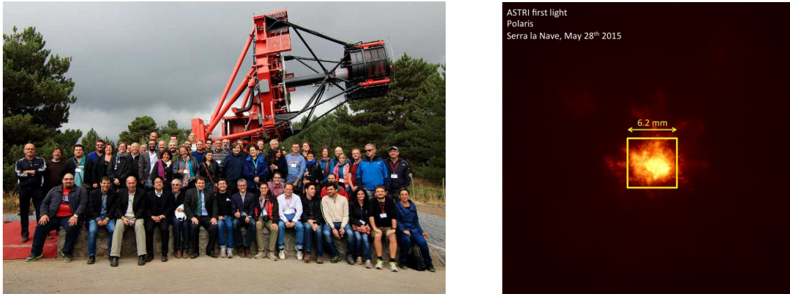
Figure 1. Left: the ASTRI Collaboration in front of the telescope during the official inauguration on 2014, September the 24th. Right: Optical image of Polaris taken on 24th May 2015 with the ASTRI SST-2M prototype and the temporary CCD camera installed during commissioning; to the best of our knowledge, the first ever image of the sky taken with a Schwarzschild-Couder telescope.