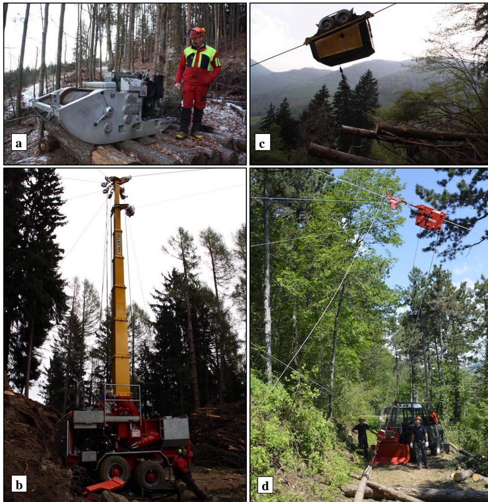
Fig. 2: a) Sled yarder; b) Mobile tower yarder; c) Self-propelled carriage-based yarder; d) Mobile yarder without a tower