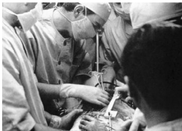
Fig. 6. Christian Barnard during his first heart transplantation