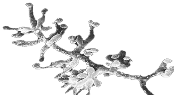
Fig. 4. Fungi imperfecti (Cyclosporin)

technique developed in Paris, in which the donor kidney (twin brother of the patient) was placed in the fossa iliaca and the ureter in the bladder of a