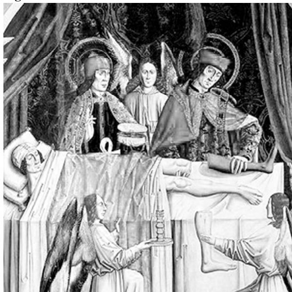
Fig. 2. St. Cosmas und Damian

Cosmas and St. Damian, Syrian healer and patrons of the doctors and barbers (martyrs after their execution on September 27 th in 287), replaced the leg of a Christian during his sleep using the leg of a dark skinned Ethiopian who died the day before (fig. 2), [2].