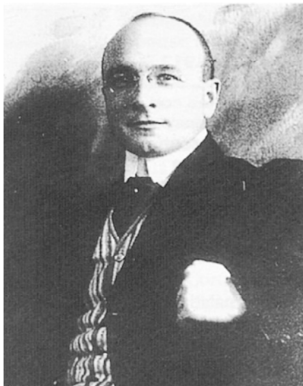
Fig. 3 a. Alexis Carrel

The first true success in humans was achieved shortly before Christmas in 1954 by the team of Moore, Murray, Merrill and Harrison in the Peter Bent Brigham Hospital in Boston (fig. 5) [13, 14]. The Boston group made used of an operative