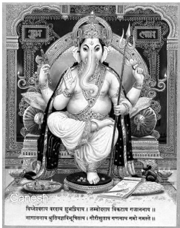
Fig. 1. Ganesha, 12th century B.C.