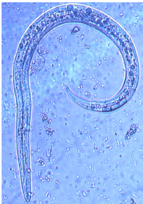
Figure 2 Baermann test: Angiostrongylus vasorum , first stage larva.

gold standard to diagnose angiostrongylosis. Nonetheless, this test is relatively time-consuming (8–36 hours), requires operator skills, and has inherent shortcomings, such as the inability to detect the parasite during the prepatent period and when larvae are not being shed, even in the presence of severe clinical signs. The prepatent period of A. vasorum is long and variable, ranging from 1 to 4 months, although the patency usually begins between ~40–60 days after infection. 6,13,100,103