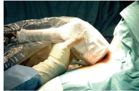
FIGURE 1: Intraoperative scans acquisition.

We then compared the ability of the preoperative and intraoperative imaging techniques to correctly locate the parathyroid lesion not only in terms of right or left laterality, but also in terms of upper or lower quadrant with respect to thyroid isthmus. The results provided by the different