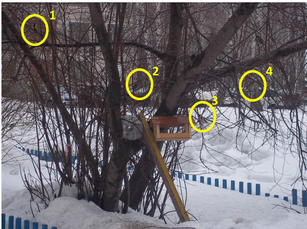
Fig. 2. The fragment of the multispecific gatherings of birds around the feeder: 1 - great tit, 2 - field sparrow, 3 - goldfinch 4 - house sparrow.

Among the winter ornithological population of airport "Tomsk" not all species of birds are attracted by feeders some species prefer to use alternative feed. These birds most often is present at the airfield when searching food and stay for a long time near the runway or even on it, constantly moving and thereby creating a potentially dangerous situation for the aircraft. Thus the biggest occurrence of mealy redpoll and snow bunting were observed in the vicinity of the runway on the vast meadow areas where these species examined stand of grass sticking out of the snow while searching the seeds. On the territory of the village these species are not encountered. A similar pattern of occurrence was observed in crow who hunted on the airfield runway exclusively near the airfield or crossing it flying over. All crows met at the airfield were also on the runway or flying over it. Black cock is avoided by the man and during the winter period is held in the part of the airfield where it grows birch undergrowth, forming gatherings of up to 6 individuals and periodically crossing the airfield through the airfield. There were no such species as parrot crossbill and nutcracker near the feeders that due to the specifics of the feeding diet do not use feeders. These two species were encountered only in the territory of the airfield however they were only on its peripheral part in a forested area posed no hazard to the AV.