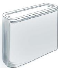
Figure 3. Sketch of additional module

A0 map-cases in a certain amount are stored in the classroom, therefore it is decided to make one additional module (Fig. 3). Its height will be 900 mm, depth - 150 mm, width - 1250 mm.