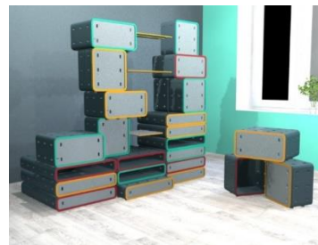
Figure 4. Final project

This equipment increases user productivity. The wishes of users are identified in the survey and taken into account in the project. A new set of furniture (Fig. 4) creates a comfortable atmosphere in the classroom, provides careful storage of works, as well as the opportunity to see and evaluate the work of other students. Another important characteristic is the ability to change the furnishings, the exhibition and the color scenario.