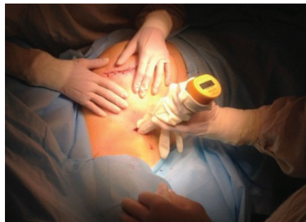
FIGURE 3. Intraoperative radio guided SLN detection with the use of the hand-held collimated gamma Finder II ® in breast cancer patients

The novel radiopharmaceutical based on ^{99m}\text{Tc-Al}_2\text{O}_3 has high accumulation in sentinel lymph nodes, with no evidence of further redistribution along the lymphatic collector, thus significantly facilitating scintigraphic and intraoperative SLN identification.