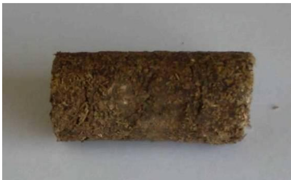
Figure 2. End product

The end product has been tested for strength, moisture resistance, transportation reliability, heavy metals content and coliforms [2].