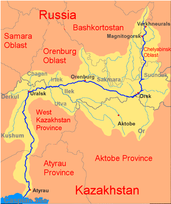
Fig.1. Map of the Ural River basin