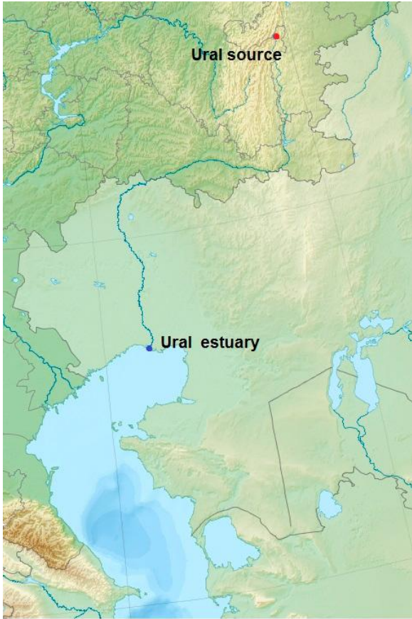
Fig.2. Map of the Ural River with source and estuary